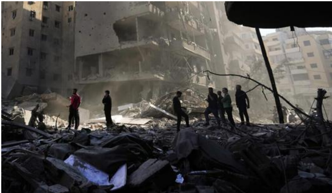
People check the site of the assassination of Hezbollah leader Hassan Nasrallah in Beirut's southern suburbs, Sept. 29, 2024.

A topical clarification, Ezekiel 28:24 validates the removal of all thrones for the returning exiles to live in safety. Ammonites, Hamas, and Hezbollah are now under military attack by the Israelis.