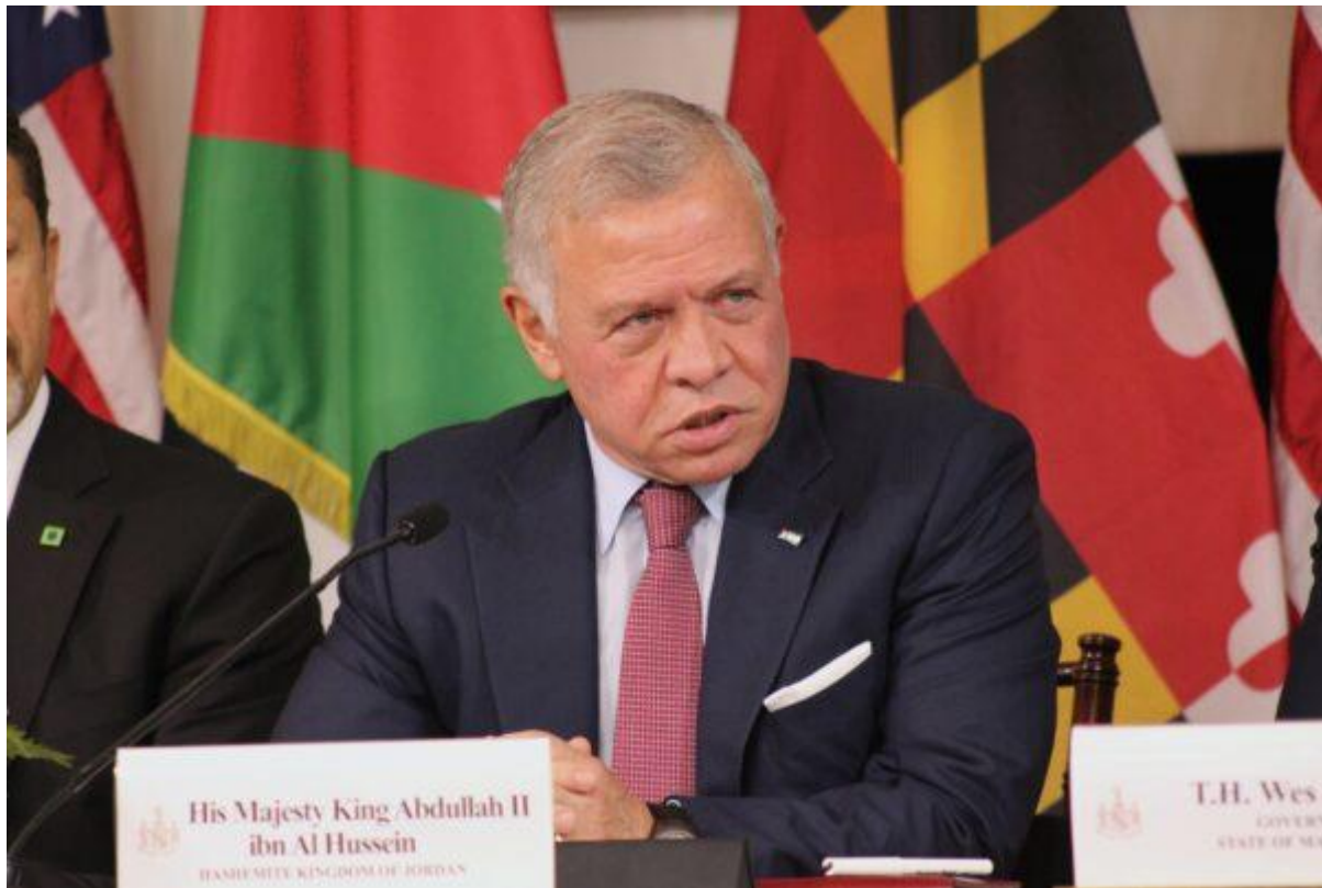
His Majesty King Abdullah II of Jordan in the Maryland State House on Sept. 25, 2024.

A quick review. (1) Abdullah II is from the family tree of Moab, a historical lineage with significant insights. Through King Balak of the Moabites, we learn the appellate procedures in the heavenly courts in the Book of Numbers.