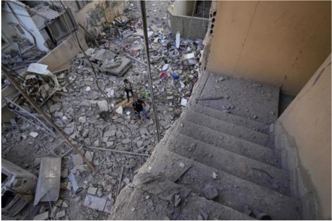
The building was bombed by Israel in the center of Beirut last night.