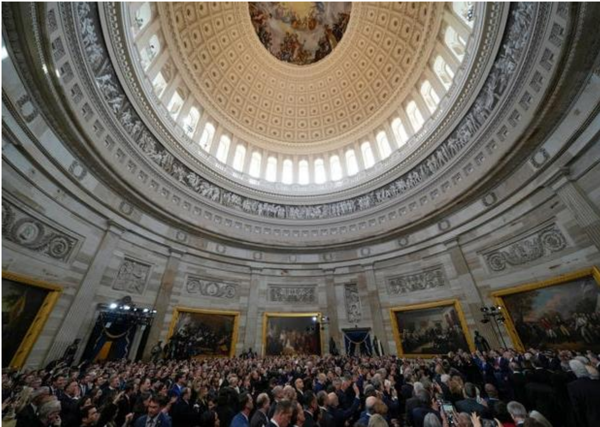
People attend the 60th Presidential Inauguration in the Rotunda of the U.S. Capitol in Washington, Monday, Jan. 20, 2025.