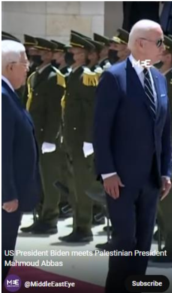
US President Biden meets Palestinian President Mahmoud Abbas