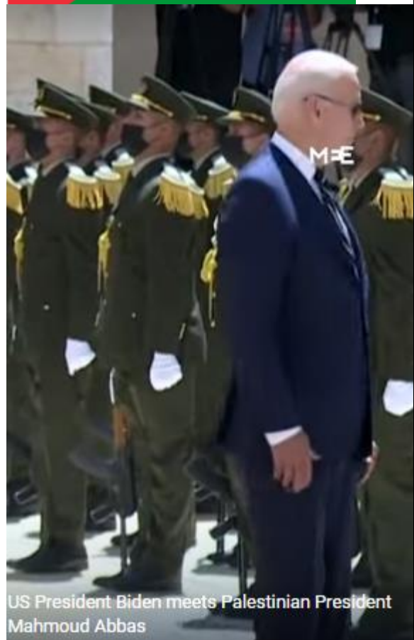
US President Biden meets Palestinian President Mahmoud Abbas