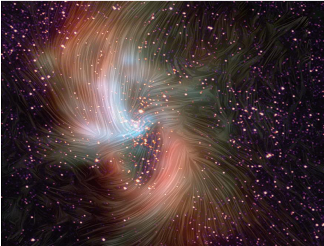
NASA image taken on June 19, 2021