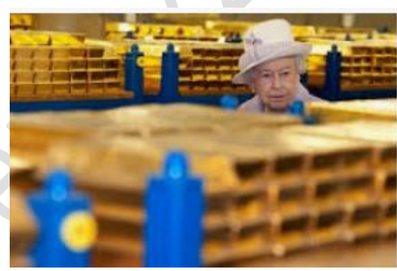
The Queen inside the gold vault at the Bank of England.