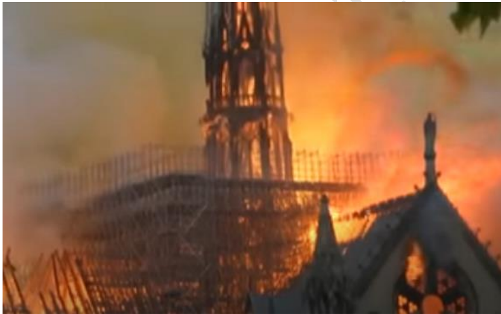
Notre-Dame Cathedral in Paris France