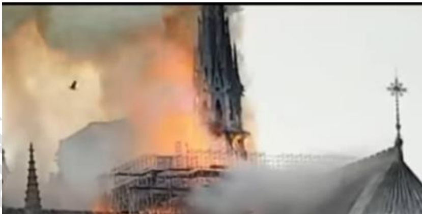
Notre-Dame Cathedral in Prais France

The Prophetic Fall of France was signal in 2019 by two signs. The Eagle's Flight over Notre-Dame Cathedral in Paris.