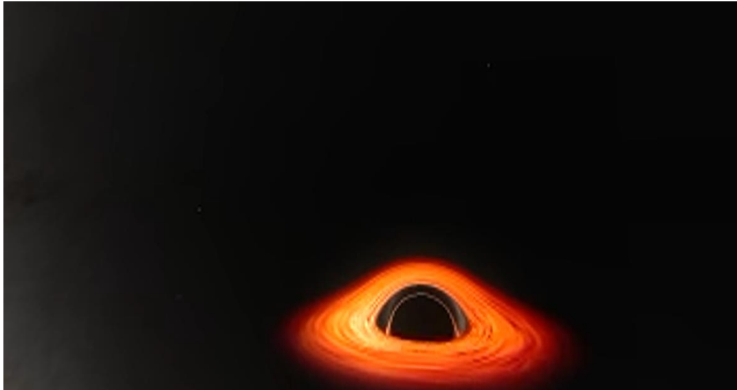
NASA simulation of a black hole

Those of us destined to be saved would have transitioned to our new home galaxy and become an interstellar civilization and a race of holy people (gods).