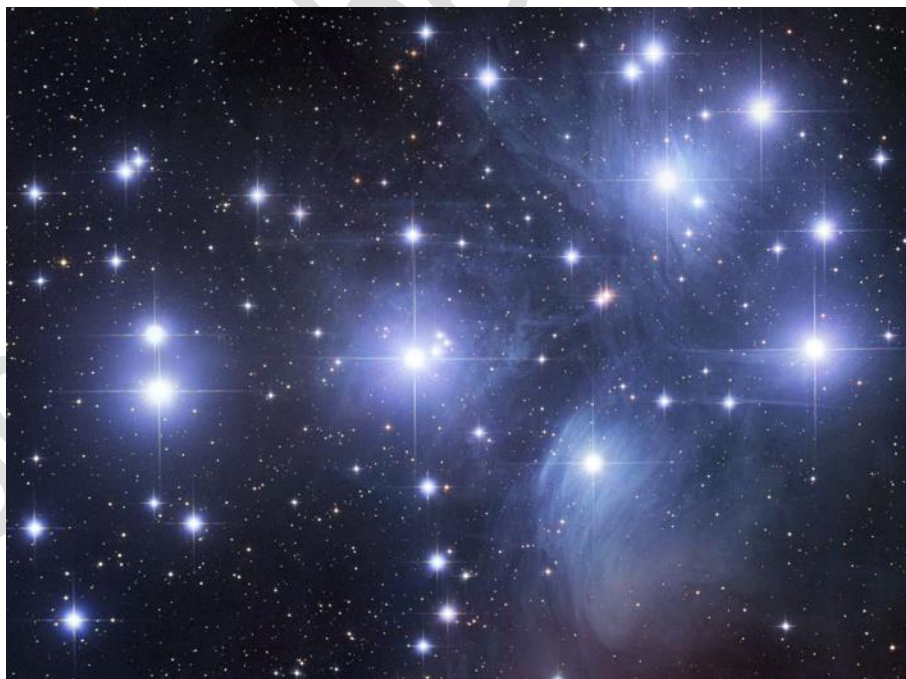
M45 THE PLEADES STAR CLUSTER

Unlike today's world, which is full of foolishness at all divisional levels of society, the people of old knew the future by looking up into the heavens, where they reference the truth. The Congregation's destiny is written in the heavens, nothing no man can do to reverse the inevitable. Yeshua being Alpha and Omega says it all—he is the Author.