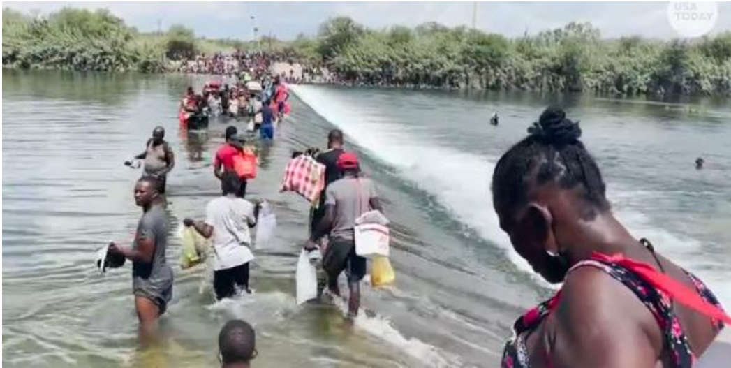
Migrants on the move worldwide