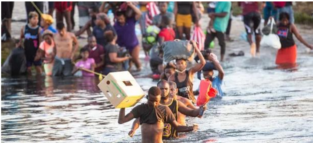
Migrants on the move worldwide