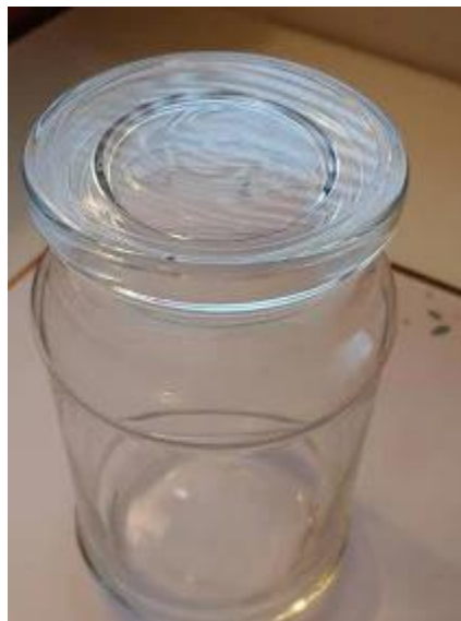
NET WT. 15 OZ.