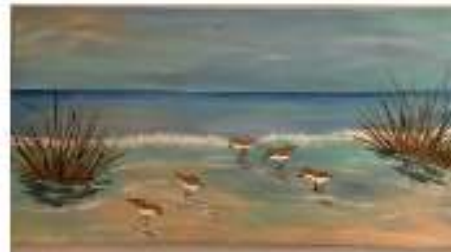
Judy Nicewicz Sandpipers on Beach 8:00-12:00 Acrylics