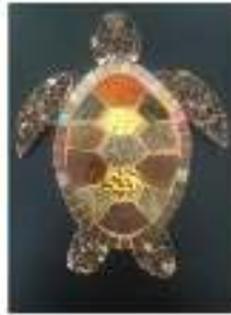
Julie Green Sea Turtle 8:00-5:30 Mosaics