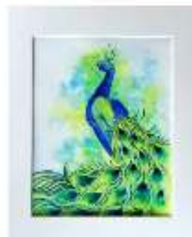
Tina Carchia Peacock 1:30-5:30 Watercolor