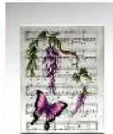
Tina Carchia Butterfly Music 8:00-12:00 Acrylic