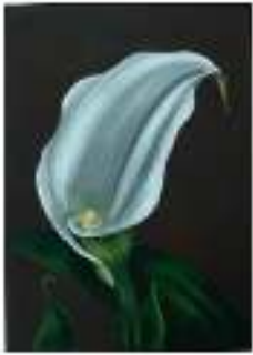
Linda O'Connell White Lily 8:00-12:00 Acrylic