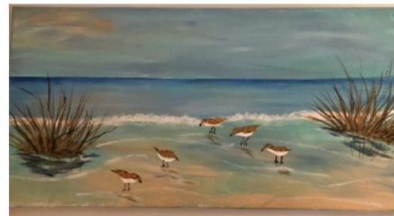
Judy Nicewicz Sandpipers on Beach 8:00-12:00 Acrylics