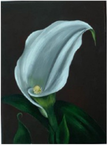
Linda O'Connell White Lily 8:00-12:00 Acrylic