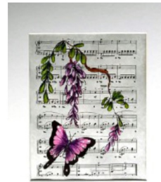
Tina Carchia Butterfly Music 8:00-12:00 Acrylic