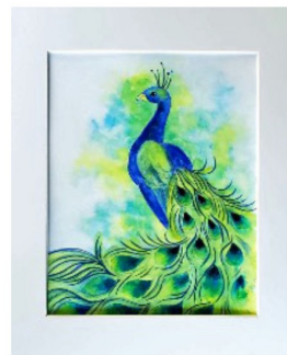
Tina Carchia Peacock 1:30-5:30 Watercolor