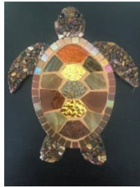
Julie Green Sea Turtle 8:00-5:30 Mosaics