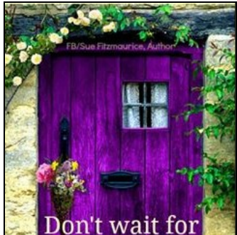
old age to wear purple. Be eccentric <u>now!</u>