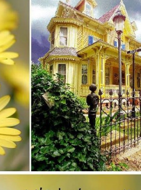
A flower does n<mark>ot th</mark>ink of competing with the next flower, it just blooms.