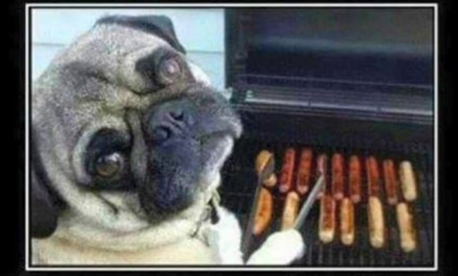
Do you want yours licked or not licked? Just kidding, they're all licked.