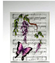
Tina Carchia Butterfly Music 8:00-12:00 Acrylic