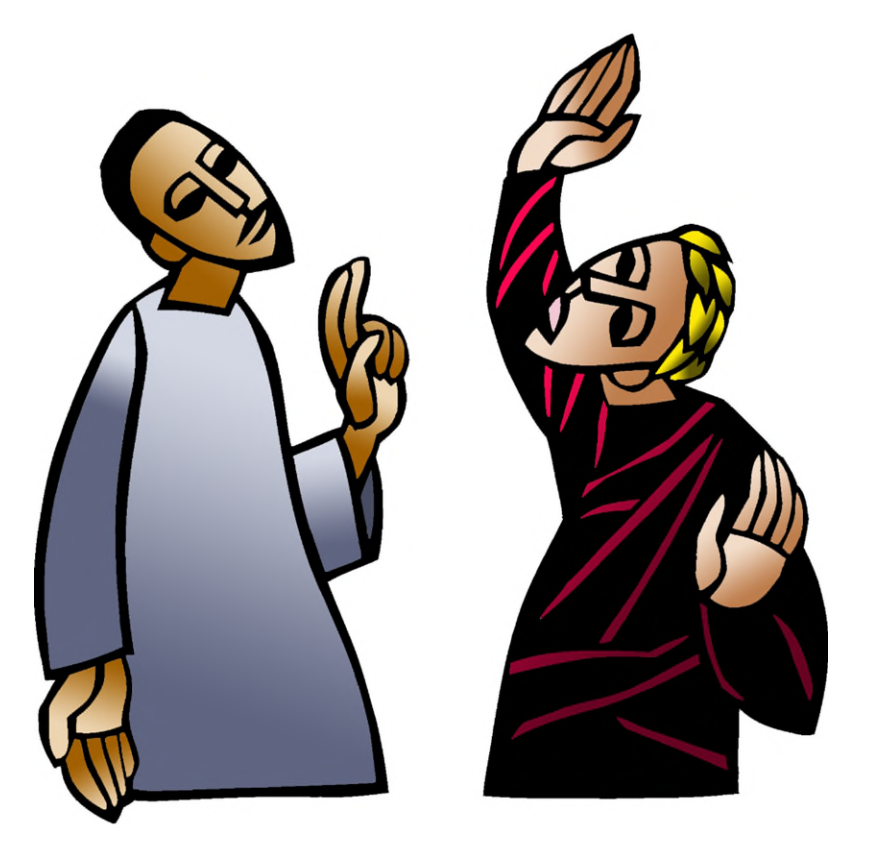
Swamp Evangelical Lutheran Church Reinholds, Pennsylvania