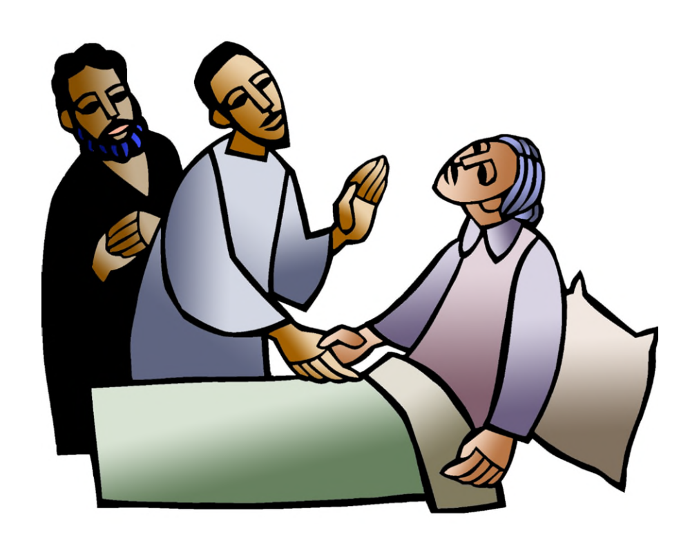
Swamp Evangelical Lutheran Church Reinholds, Pennsylvania