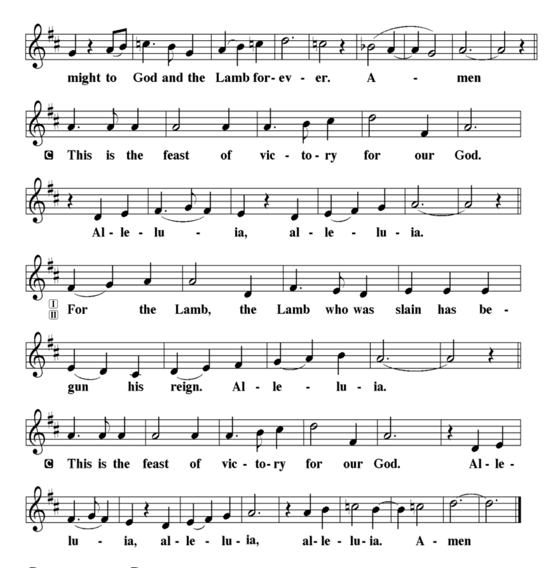
PRAYER OF THE DAY