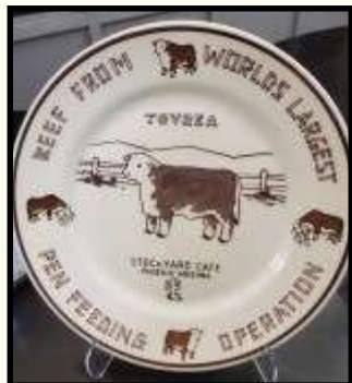
Ed now collects plates such as this from the Tovrea Stockyard Café, the precursor to The Stockyards Restaurant.