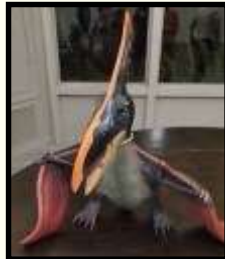
Lesley's spooky items include vintage fine children's literature and a colorful scary pterodactyl.