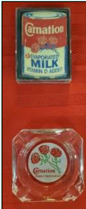
Ashtray and playing cards

Carnation milk is the best in the land Here I sit with a can in my hand No teats to pull, no hay to pitch Just punch two holes in the son-of-a-bitch