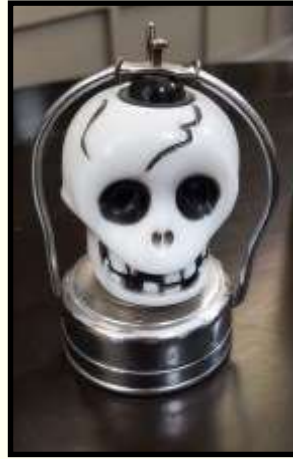
Bob's skull lantern from the 1950s