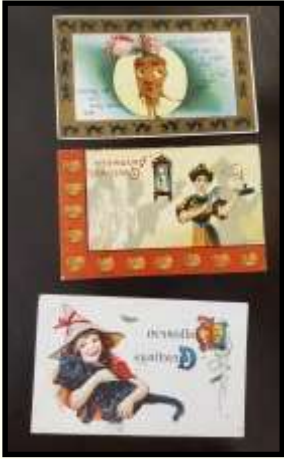
Vintage post cards from Betty. She says such items are becoming quite scarce, and valuable!