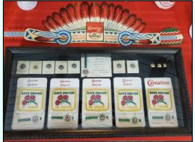
Pocket protectors and awards, and a near perfect child's cardboard Indian headdress