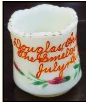
Seth's recent acquisition is this beautiful custard glass toothpick holder, proclaiming Douglas, AZ as The Smelter City, July 4 1908.