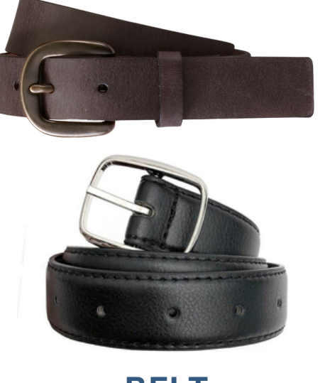
BELT BROWN OR BLACK