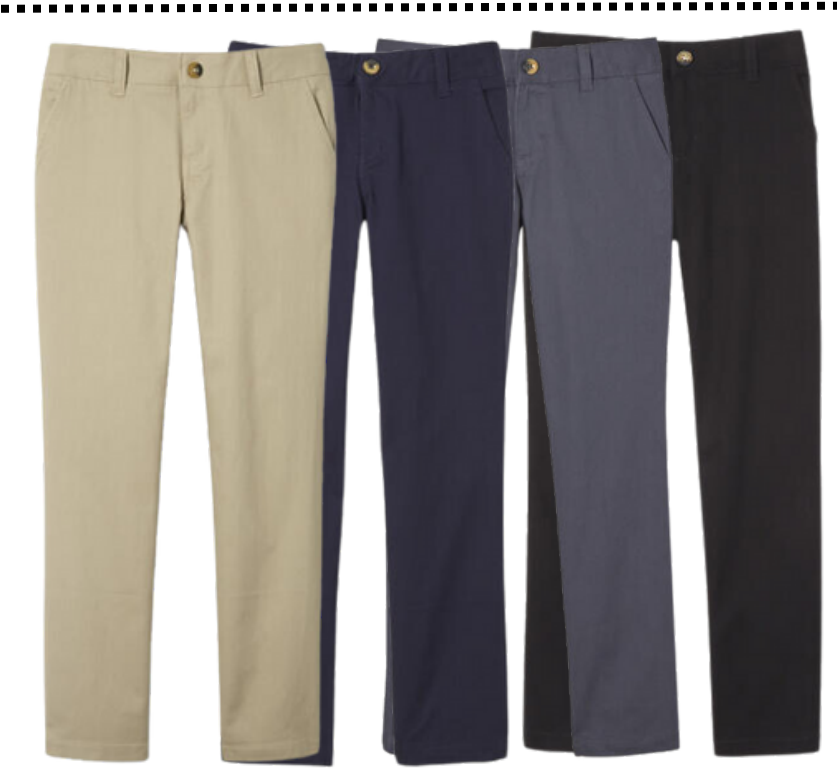
KHAKI, NAVY, GREY OR BLACK

PANTS, SKIRT OR SKORT KHAKI OR CHINO MATERIAL