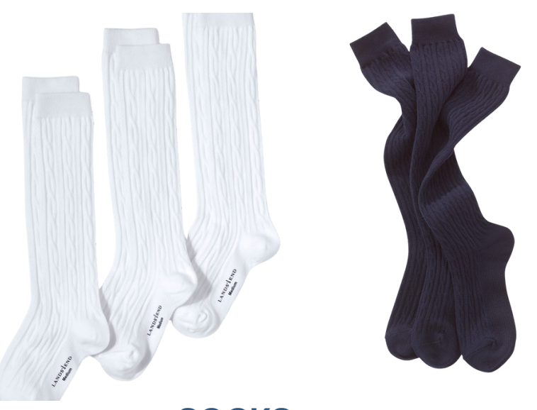
SOCKS WHITE, NAVY, GREY OR BLACK