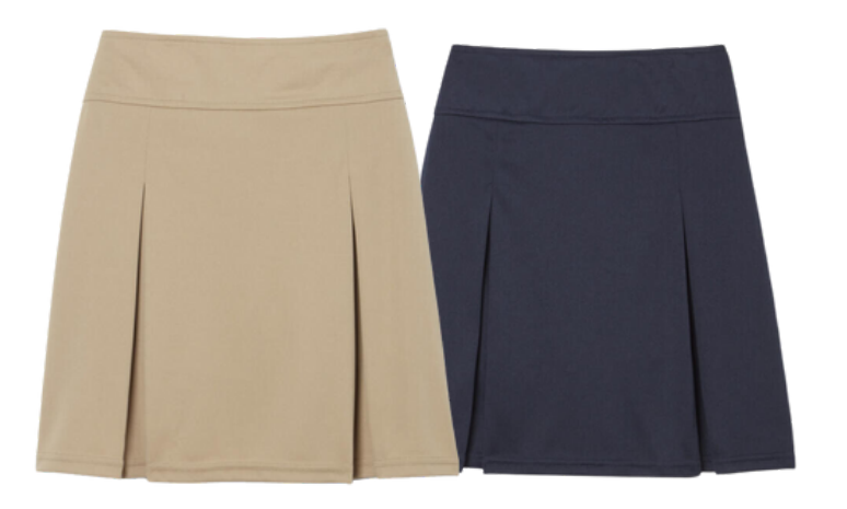
KHAKI OR NAVY

PANTS, SKIRT OR SKORT KHAKI OR CHINO MATERIAL