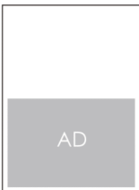
1/2 page horizontal