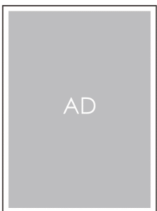
Full page no bleed