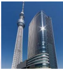
Tokyo Sky Tree

2. TOKYO See Tokyo at its dynamic best with an action packed day of sightseeing taking in the Imperial Palace, Asakusa Temple and Nakamise shopping arcade as well as the impressive 634m high Tokyo Sky Tree. Following a traditional teppanyaki lunch, enjoy a cruise along the Sumida River for optimum cherry blossom viewing (weather permitting). (B L D)