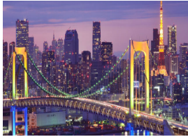
Tokyo night view

1. CAIRNS – TOKYO Meet your tour director at Cairns International Airport to board your Jetstar flight bound for Tokyo's Narita airport. Upon arrival transfer by chartered coach to your inner city hotel. (Flight departs Cairns at 12.45pm and arrives Narita 7.00pm)