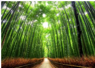
Bamboo grove Kyoto

Another day to explore Japan's most loved city. Today's cultural enrichment activities include a Zen meditation experience at Kodaiji Temple as well as a visit to the Nishijin textile centre. No visit to Kyoto is complete without a visit to the Kiyomizu Temple (literally "Pure Water Temple") - the most celebrated temple in Japan. It was founded in 780 on the site of the Otowa Waterfall in the wooded hills east of Kyoto, and derives its name from the fall's pure waters. (B L)