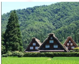
Shirakawa- go village

5. TAKAYAMA - SHIRAKAWA – TAKAYAMA Continue through Japan's beautiful mountain scenery to one of the country's most remote regions, Shirakawa. Protected as a UNESCO World Heritage Site, the unique Gassho-Zukuri (meaning joined hands) style thatched houses can only be found in this area. This afternoon, journey through the Japanese Alps via one of Japan's longest road tunnels, to the secluded town of Gokayama to try your hand at traditional Japanese rice paper making. (B L)