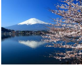
Lake Hakone- Mt Fuji National Park

5. TAKAYAMA - SHIRAKAWA – TAKAYAMA Continue through Japan's beautiful mountain scenery to one of the country's most remote regions, Shirakawa. Protected as a UNESCO World Heritage Site, the unique Gassho-Zukuri (meaning joined hands) style thatched houses can only be found in this area. This afternoon, journey through the Japanese Alps via one of Japan's longest road tunnels, to the secluded town of Gokayama to try your hand at traditional Japanese rice paper making. (B L)