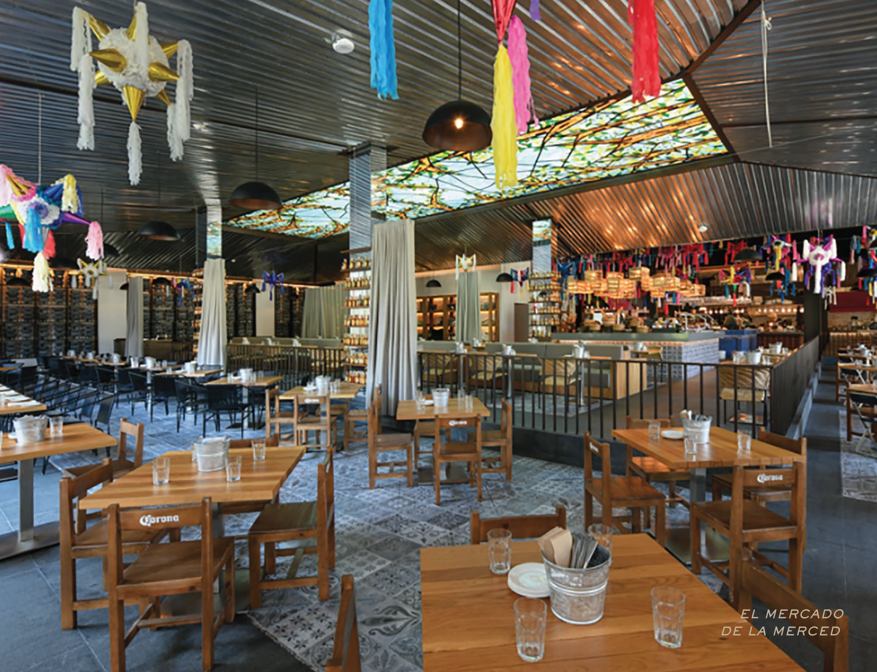
EL MERCADO DE LA MERCED