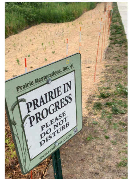
PROTECTING OUR LAKES (POL) SHORELINE INITIATIVE