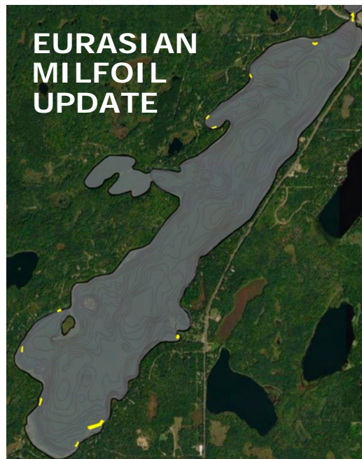
EURASIAN MILFOIL UPDATE The 2021 survey map shows the areas on Roosevelt Lake where Invasive Eurasian Milfoil was observed in significant density to receive DNR approval for treatment.