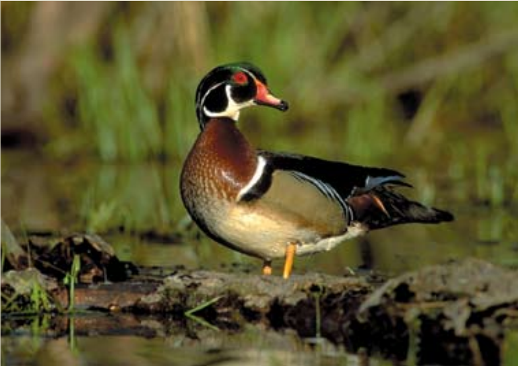
Healthy wetlands attract nesting and migrating waterfowl.