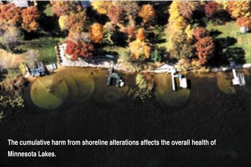
The cumulative harm from shoreline alterations affects the overall health of Minnesota Lakes.

It's like walking in a garden. If a neighbor kid came through once, that would be no big deal. But if the whole neighborhood came through, your garden would be trampled.