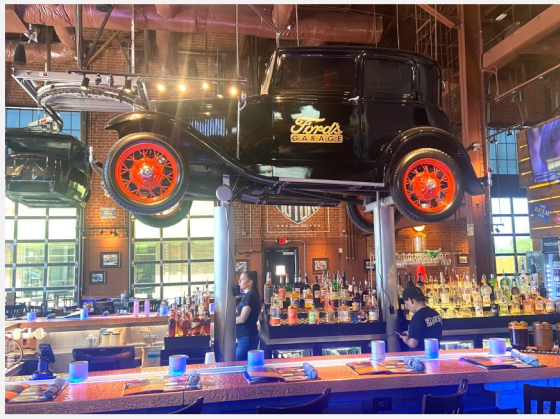
Left & Right: We had an interesting Mystery Lunch at Ford's Garage in Cincinnati. Lots of Ford memorabilia. Including a Model T hanging over the bar area.