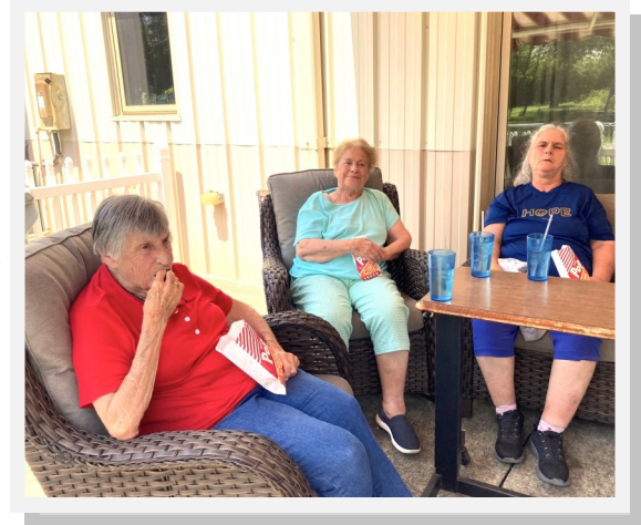
Above: The Adult Day Center clients enjoyed some time out on their patio on one of the afternoons that wasn't extremely hot. They recently got new patio furniture.