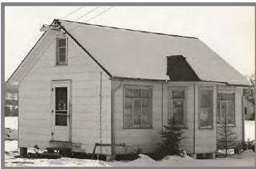
ORIGINAL BUILDING NOW THE “COFFEE SHOP” (FRONT COUNTER AREA) 1950's

The Iron Kettle Landmark Restaurant was first established in 1947. Five generations of owners have operated this well-known restaurant as the “Iron Kettle”. However, it was first known as the Aurora Drive-In. The restaurant has always featured home-cooked meals prepared in-house every day and we are committed to honoring that legacy.