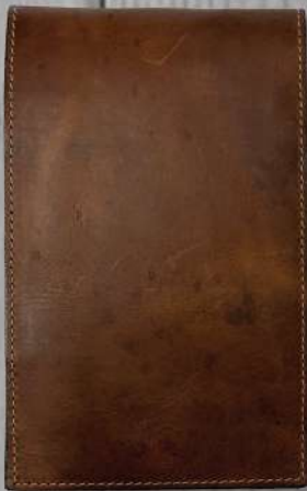
Wrangler Yardage Cover #95494 (7.5"x 4.5" Closed)