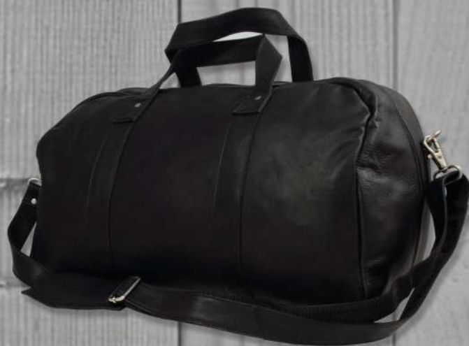
Tour Duffle #93089 (18" x 12" x 8")