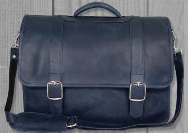
Aristocrat Tech Case #92119 (15"x 3.5"x 12")