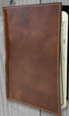
Carson Pocket Clip #95514 (6.5"x 4.5")