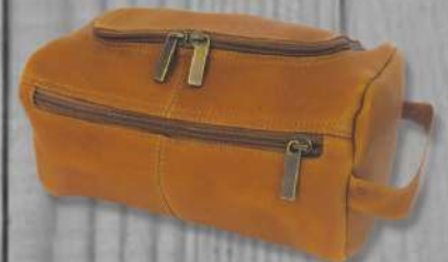
Groomsman Kit #94179 (10" x 5" x 6")