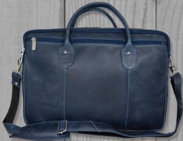
Pacesetter Brief #92178 (15"x 4.5"x 11")