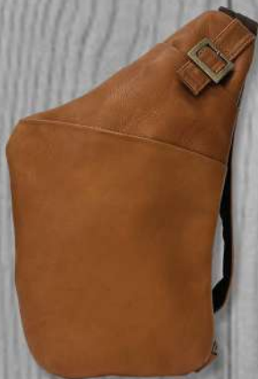
Truckin Sling Pouch #90274 (14" x 8.5")