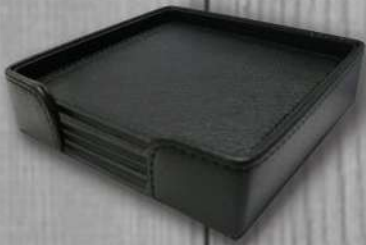
Coaster Set #96019 (4.25" x 4.25" x 1")