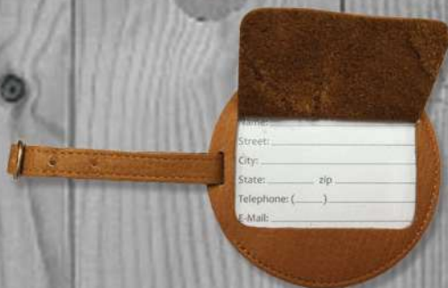
Luxe Bag Tag #95234 (4" Diam)