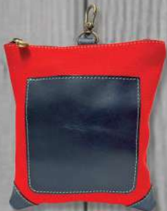
Bravo Pouch #97541 (7" x 8")