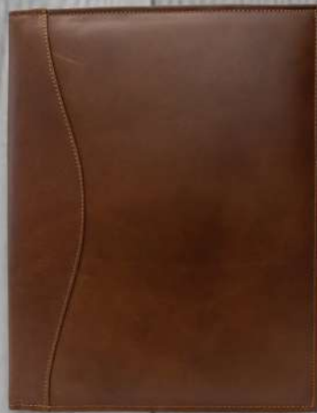
Denver Portfolio #95600 (9.5"x 12.5")