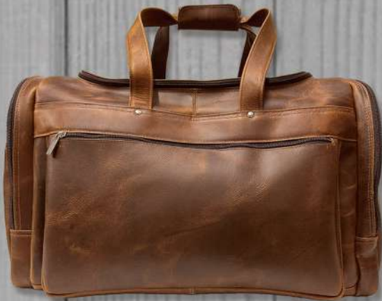
Rebel Duffle #92149 (20" x 10" x 14")