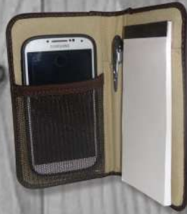
Smart Pocket Plus #92506 (4.5" x 7")