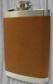
Advantage Flask #96049 (8oz.)