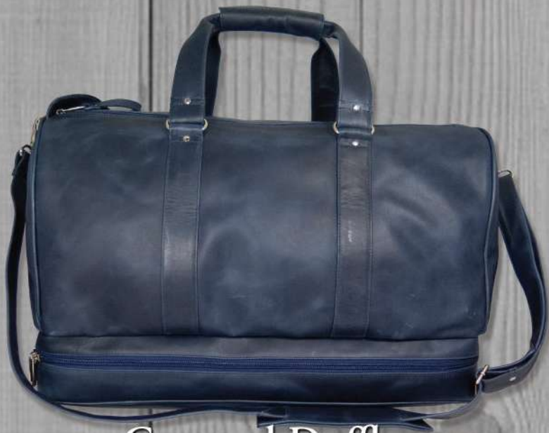
Concord Duffle #92110 (20"x 10.5"x 12")