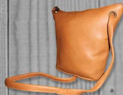
Zip Pouch Purse #95189 (6.5" x 7")