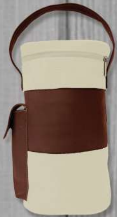
Bimini Wine Case #94496 (12.5" x 7" x 3.75")