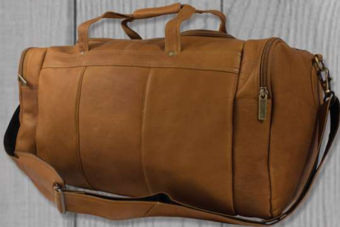
Huntsman Duffle #95094 (19.5" x 9.5" x 10")