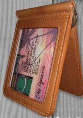
ID Billfold #99125 (4" x 2.75")