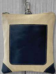
Aria Pouch #99190 (7" x 8")