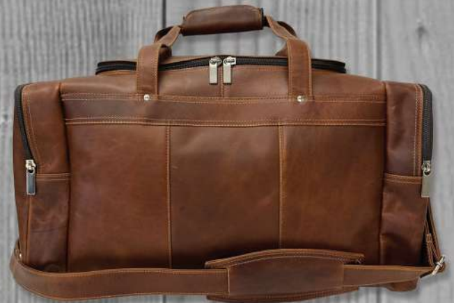
Roswell Duffle #95594 (19.5" x 9.5" x 10")