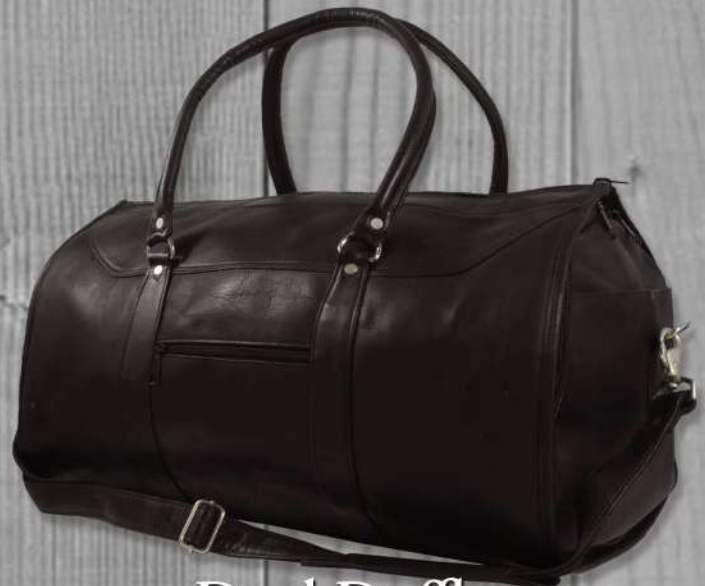
Dual Duffle #93079 (20.25" x 9" x 10")