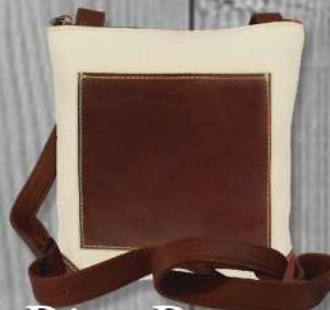
Riva Purse #95193 (7" x 8")