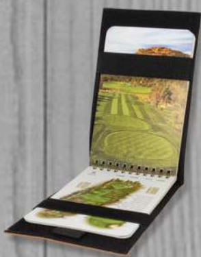
Yardage Cover (Flip) #94941 (7.5" x 4.5" Closed)