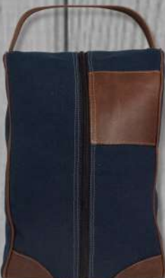
Charter Shoe Bag #94691 (9.25" x 4.5" x 13.5")