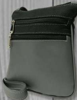
Vixen Purse #96349 (7" x 8")