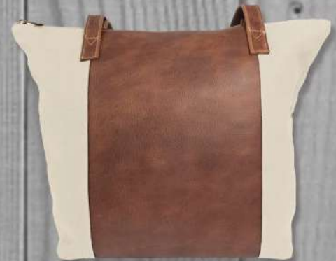
Panama Tote #94401 (11.5" x 5" x 12.5")