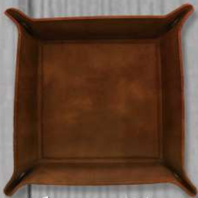
Alamo Tray #95906 (5" x 5")