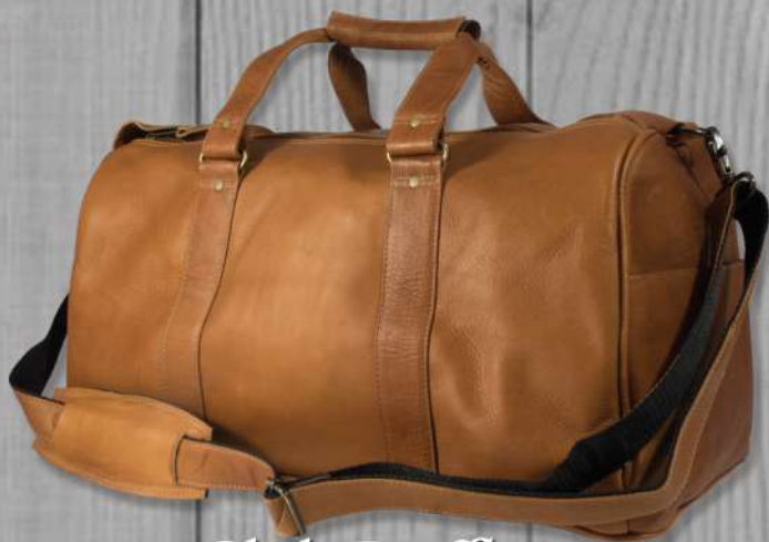
Club Duffle #90172 (20" x 9" x 10")