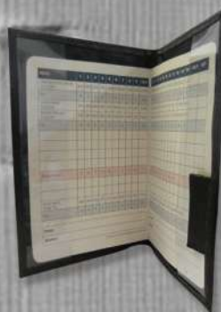
Scorecard Book #90764w (6.5" x 4.5") #90764x (5.75" x 3.3")