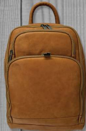
Journey One Strap Backpack #90275 (15" x 11" x 4.5")