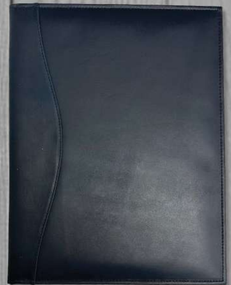
Nobleman Portfolio #92600 (9.5" x 12.5")