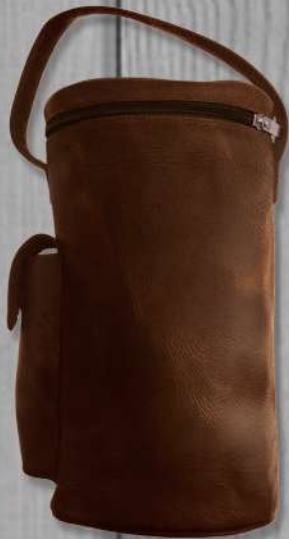
Boone Double Wine #95696 (12.5"x 7"x 3.75")