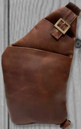
Cassidy Sling Pouch #95274 (14" x 8.5")