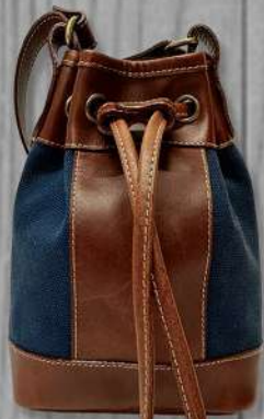
Brooke Bucket Crossbody #94277 (11" x 8.5" x 5")