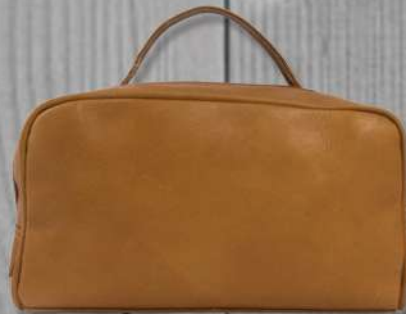
Dop Kit #95089 (10" x 6" x 7")