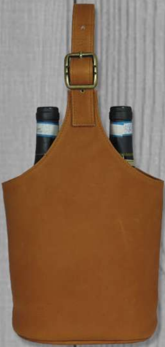
Napa Double Wine Case #95252 (7.5" x 4" x 15.5")