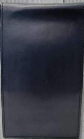
Eagle Yardage Cover #92941 (4.5" x 7.5")