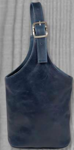
Luna Wine Case #92525 (7.5"x 4"x 15.5")