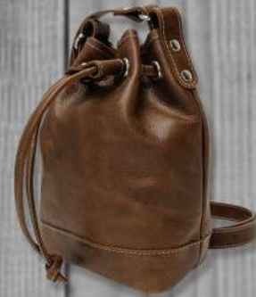
Ella Bucket Crossbody #95276 (8" x 5.5" x 3.5")