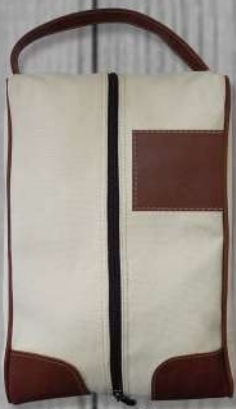
Paradise Shoe Bag #90469 (9.25" x 4.5" x 13.5")