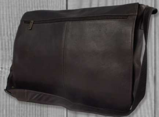
Mail Bag #91899 (16" x 11.5" x 4")