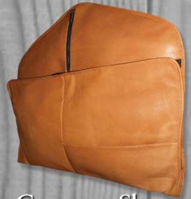
Garment Sleeve #90163 (24" x 39" x 1")