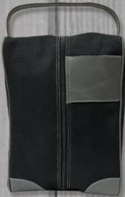
Bootlegger Shoe Bag #96691 (13.5" x 9.25" x 4.5")