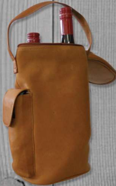
Double Wine Case #91186 (12.5" x 7" x 3.75")