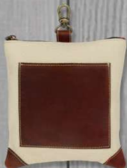
Vida Pouch #95190 (7" x 8")