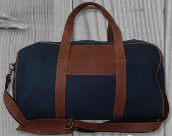
Captain's Duffle #92089 (18" x 12" x 8")