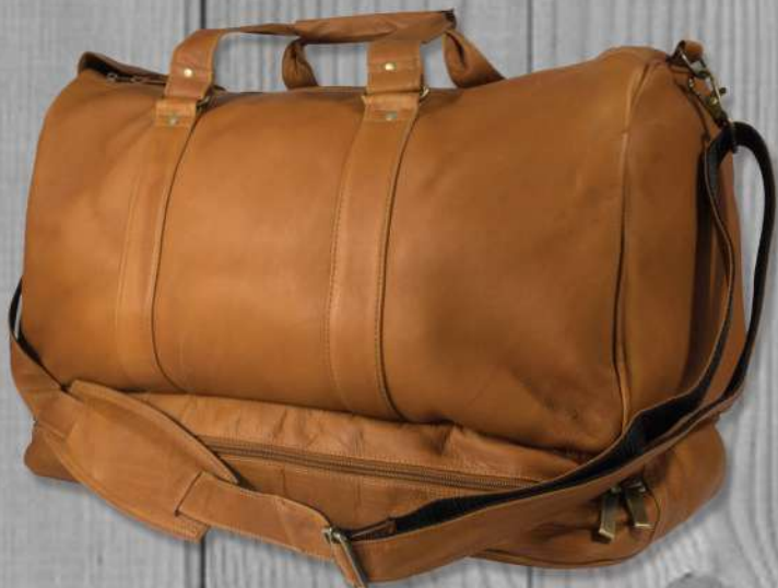
Summit Duffle #90110 (20" x 10.5" x 12")