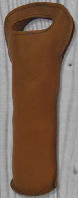
Baco Single Wine Case #90807 (3.75" x 3.75" x 15")