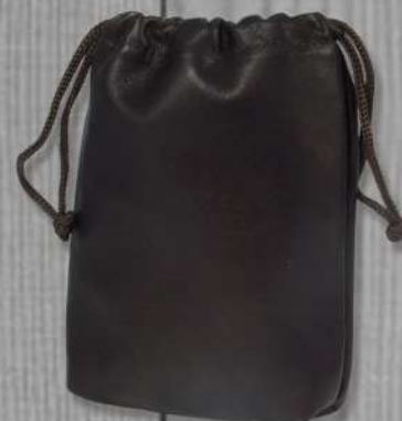
T-Plus Valuables Pouch #90103 (6.75" x 5.25")