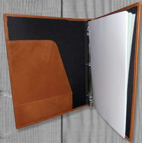
Big Binder #90233 (9.75" x 1.5" x 11.75)