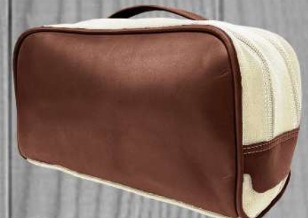
Havana Dop Kit #94494 (10" x 6" x 7")