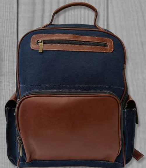
Admiral Backpack #94529 (14" x 8" x 17")