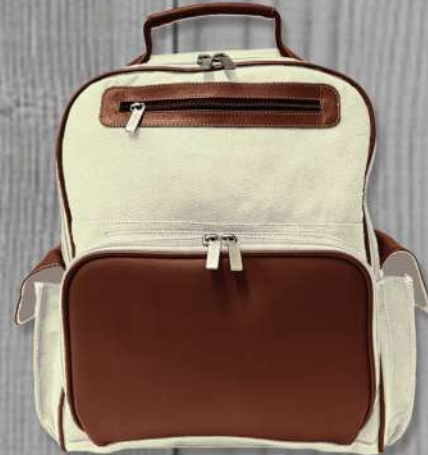
Cabo Backpack #94452 (15" x 8" x 17")