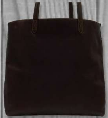
Dia Tote #90621 (10" x 5" x 10")