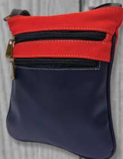
Bella Purse #97349 (7" x 8")