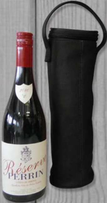
Single Wine Case #90806 (12.5" x 3.5" Diam)