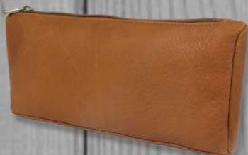
Omni Pouch #95045 (10.5" x 1.5" x 5.25")