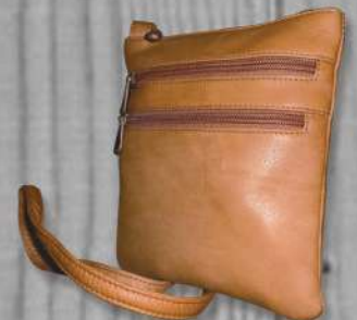
Vegas Purse #97349 (7" x 8")