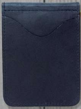
Chill Billfold #92155 (2.75" x 4")