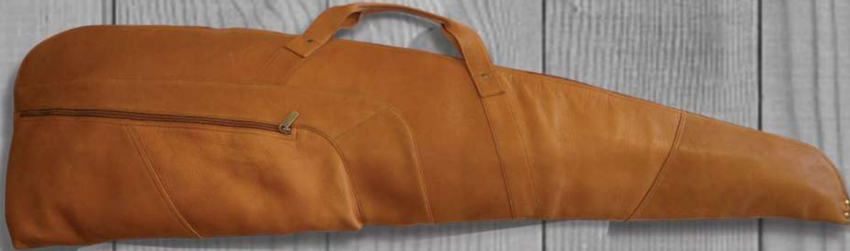
Constitution Rifle Case #95092 (48" x 13.5")