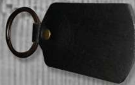
Key Fob #94776 (2.5" x 1.5")