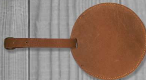
Bag Tag #90637 (4" Diam)