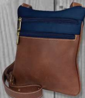
Cayman Purse #94349 (7" x 8")