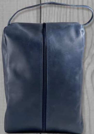
Fairway Shoe Bag #98169 (9.25"x 4.5"x 13.5")