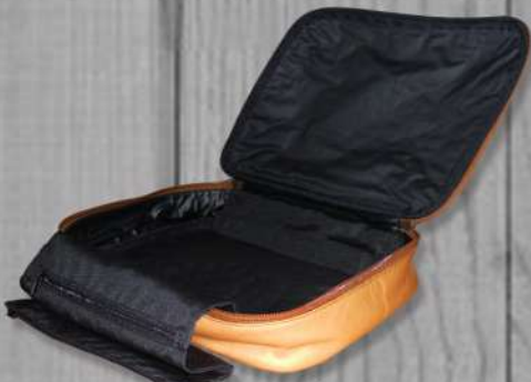
Executive Travel Case #90213 (12" x 9.5" x 2.5")