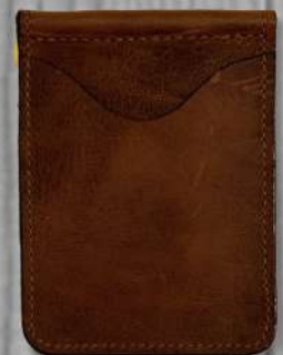
Renegade Billfold #93155 (4"x 2.75")