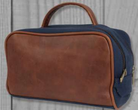
Cabin Dop Kit #95081 (10" x 6" x 7")