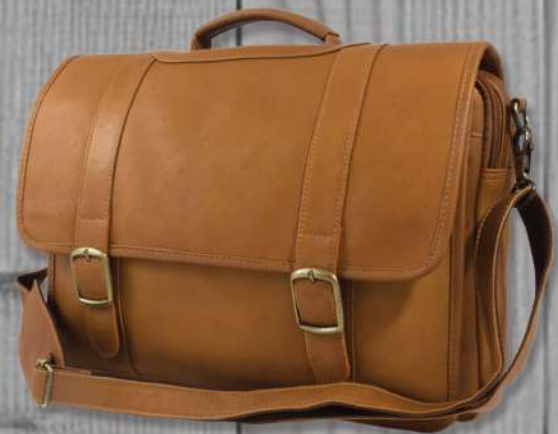
Notebook Case #91199 (15" x 12" x 3.5")