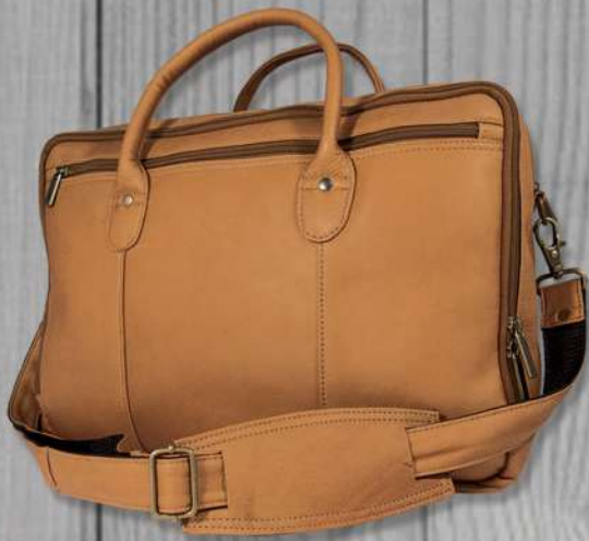
Standard Brief #92789 (15" x 4.5" x 11")