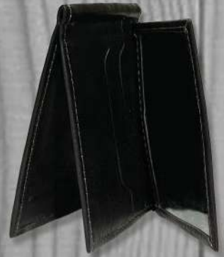
Two Fold #94782 (4" x 2.75")