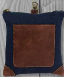
Leeward Pouch #91190 (7" x 8")