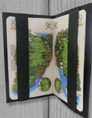
Yardage Cover (Book) #94956 (4.5" x 7.5" Closed)