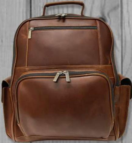
Outlaw Backpack #95352 (14" x 8" x 17")