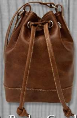
Jessie Bucket Crossbody #95277 (11"x 8.5"x 5")