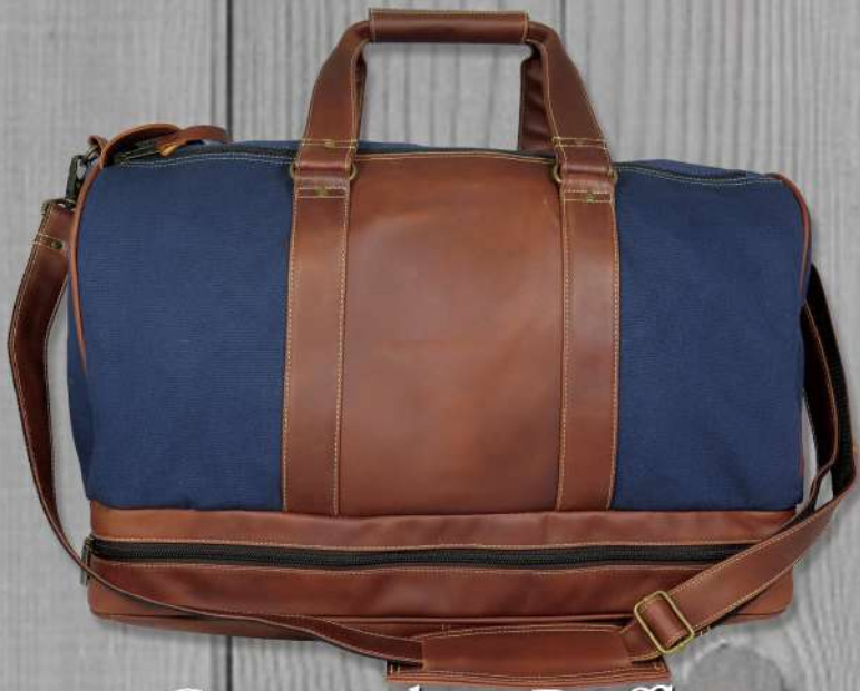
Commodore Duffle #90410 (20" x 10.5" x 12")