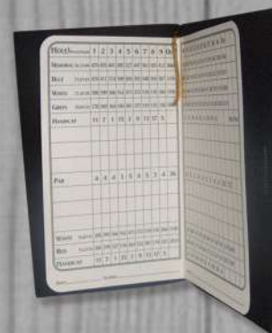
Pocket Clip Scorecard #95140 (6.5" x 4.5")