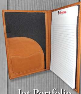
Jot Portfolio #96039 (6.25" x 8.75")