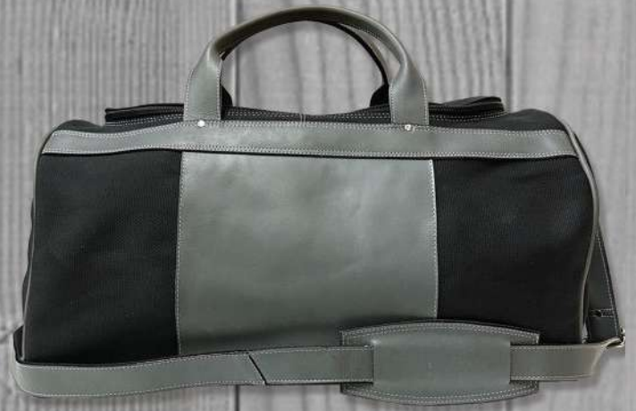
Smuggler Duffle #96001 (19" x 11" x 11")