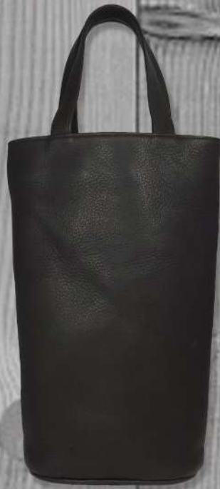
Valley Double Wine Case #95251 (7" x 4" x 18")