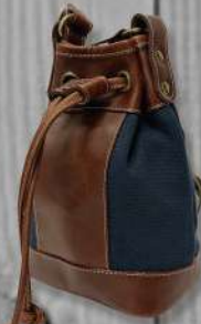
Betsy Mini Bucket #94276 (8" x 5.5" x 3.5")