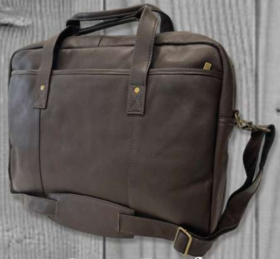
Sport Brief #95056 (19.5" x 13.5" x 3.5")