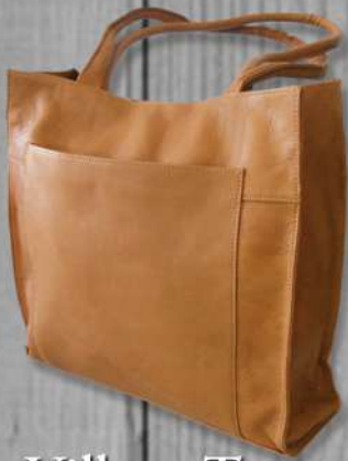
Village Tote #95419 (12.5" x 12" x 4")