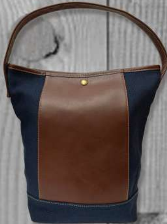
Cart Tote #95390 (7" x 9" x 5.5")