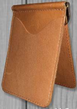
Money Billfold #90155 (4" x 2.75")