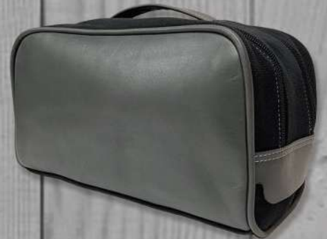
Aces Dop Kit #96081 (10" x 6" x 7")