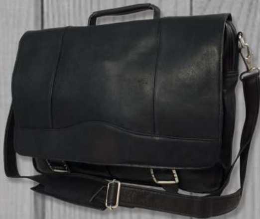
Flap Brief #91819 (15.5" x 11" x 2.5")