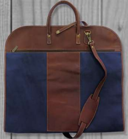
Regatta Garment Bag #94216 (23.5" x 1.5" x 42")