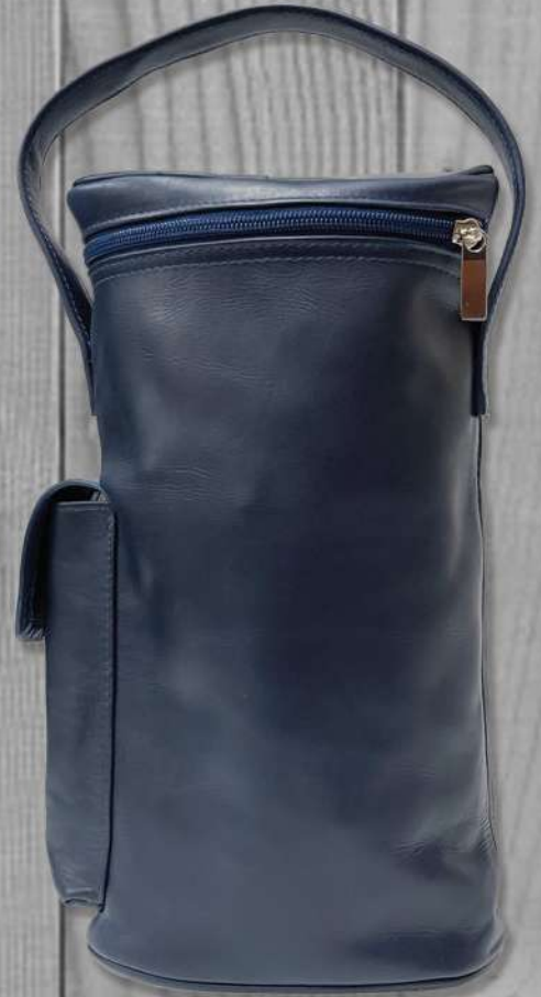
Amor Double Wine Case #92186 (12.5" x 7" x 3.75")