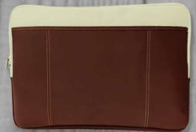
Freeport Sleeve #91252 (15" x 10.5")