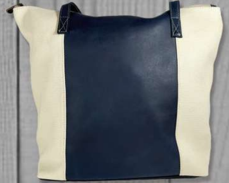
Roma Tote #99404 (11.5" x 5" x 12.5")