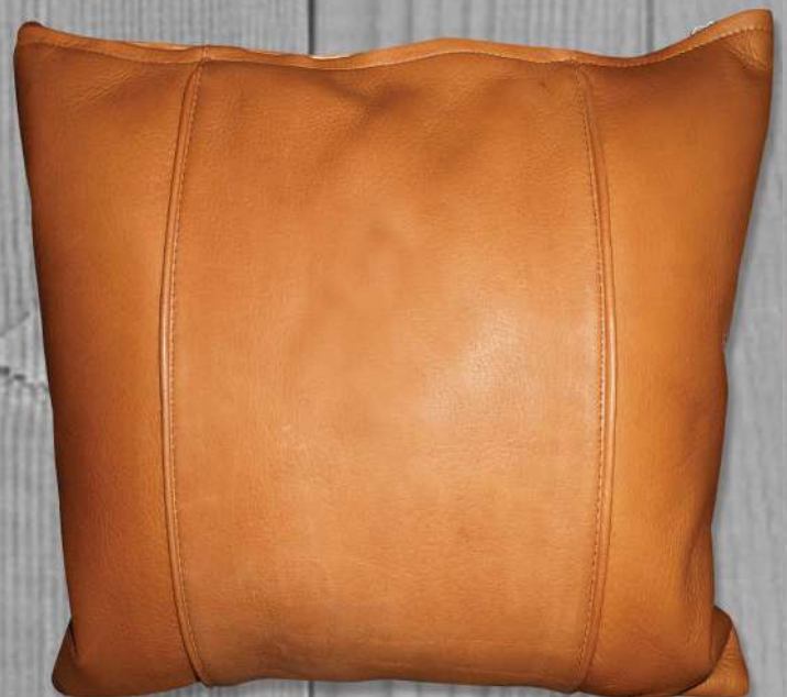
Large Pillow #94901 (18" x 8" x 18")