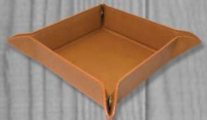
Tray #94906 (5" x 5")