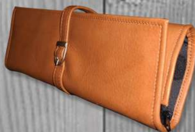
Jewel Case #94999 (9" x 4" x 2")