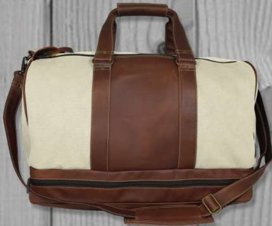
Calypso Duffle #90510 (20" x 10.5" x 12")