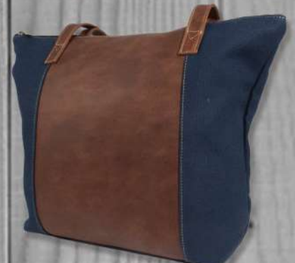
Port Tote #95401 (11.5" x 5" x 12.5")