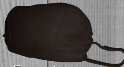
Cosmetique #94199 (10" x 6" x 4")