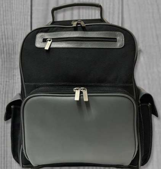
Rustler Backpack #96529 (15" x 8" x 17")