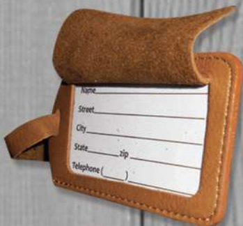
Luggage Tag #94807 (5" x 2.5")