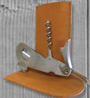
Fiesta Tool #96029 (4.75" x 2.75")