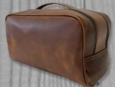
Colt Dop Kit #93508 (10" x 6" x 7")