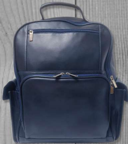
Primo Knapsack #98352 (14"x 8"x 17")