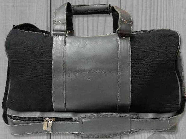
Fortune Duffle #96110 (20" x 12" x 10.5")