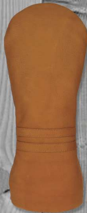
Driver Cover #95286 (7" x 4.5" x 15.5")