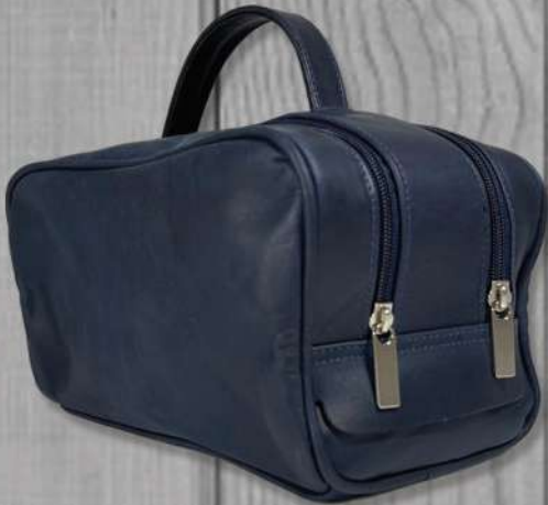
Turo Dop Kit #92508 (10" x 6" x 7")