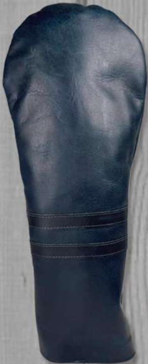
Bolo Driver Cover #92528 (7" x 4.5" x 15.5")