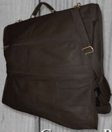
Reserve Garment Bag #92039 (24" x 42" x 3")