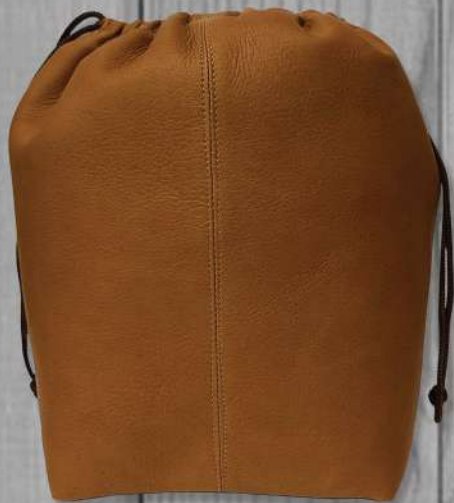
Shag Bag #94726 (8.25" x 9.5" x 3.5")