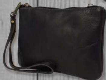
Stadium Purse Plus #95109 (7.5" x 5")