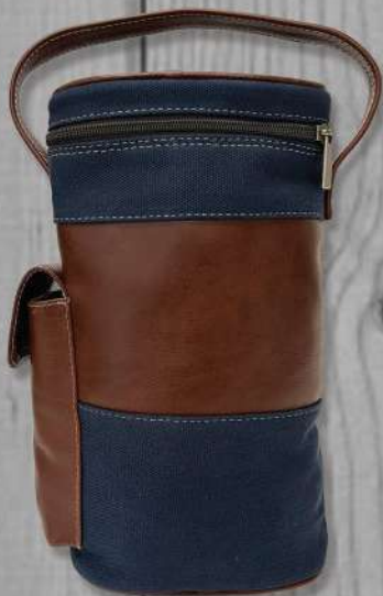
Dockside Wine Case #94186 (12.5" x 7" x 3.75")