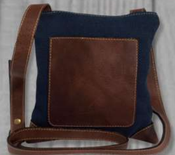
Marina Purse #91193 (7" x 8")