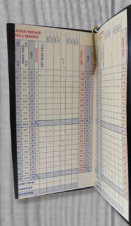
Clip Scorecard (Book) #94929 (4.5" x 7.5" Closed)