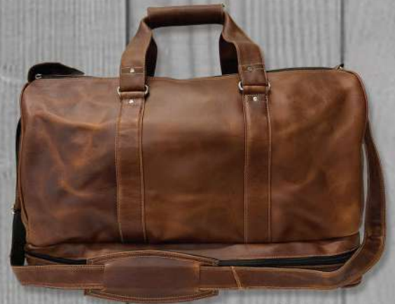
Bronco Duffle #90310 (20" x 12" x 10.5")