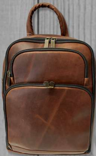
Buster One Strap Backpack #95275 (15"x 11"x 4.5")