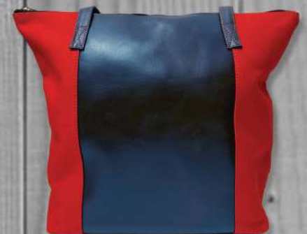
Paloma Tote #97401 (11.5" x 5" x 12.5")