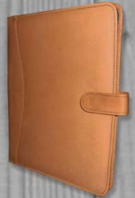
Tablet Cover #95008 (8" x 9.75")