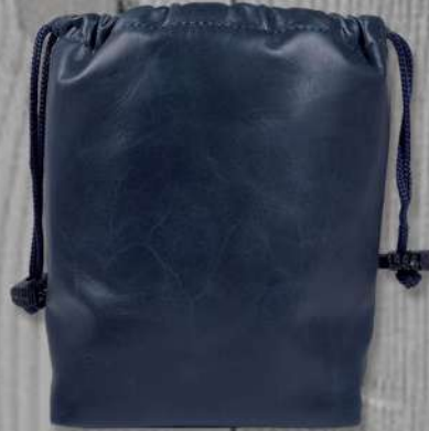
Monte Pro Pouch #92493 (7.5" x 3.5" x 7.5")