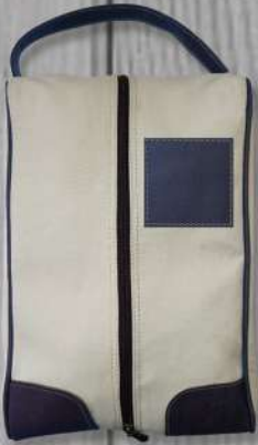
Nova Shoe Bag #99691 (9.25" x 4.5" x 13.5")