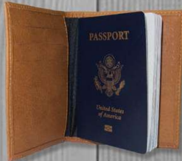
Passport Wallet #95191 (4.5" x 5.5")