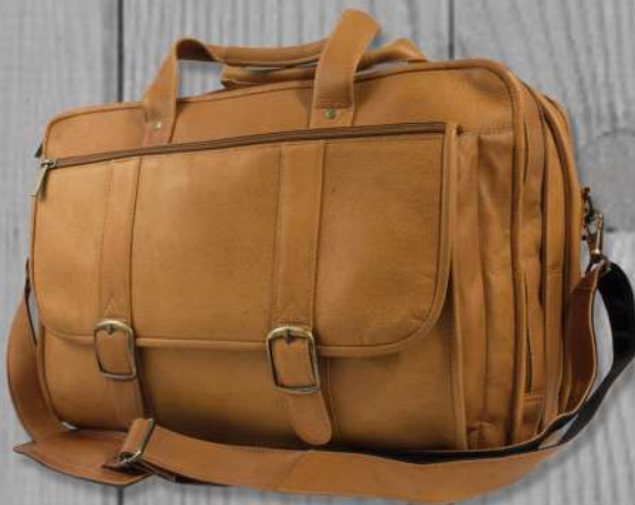
Partners Brief #91009 (17" x 13.5" x 8.5")