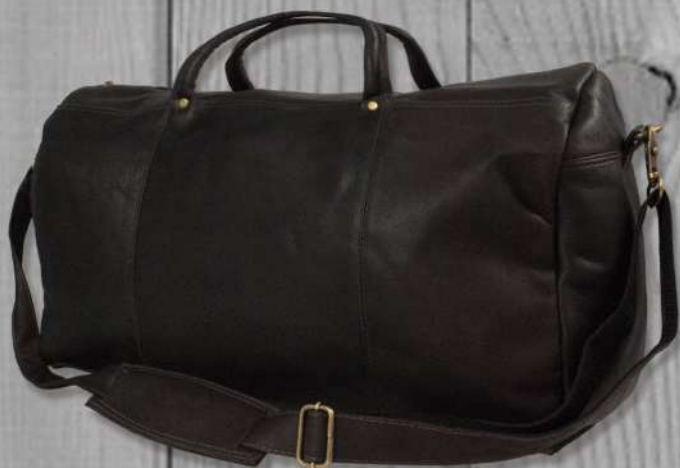
Basic Duffle #95110 (19" x 8.5" x 11")