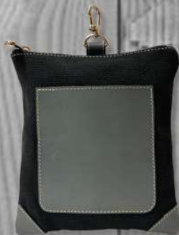
Bounty Pouch #96190 (7" x 8")