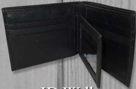
ID Wallet #90178 (4.25" x 3.5")