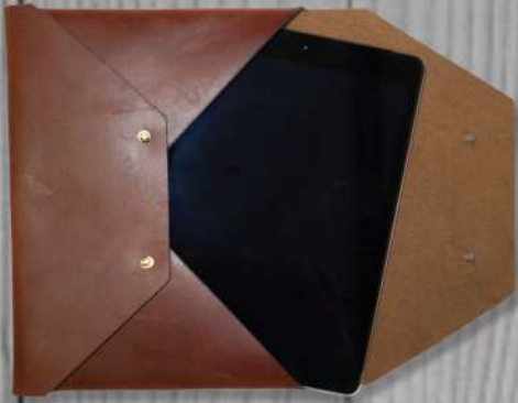
Stash Tablet Case #82145 (8.25" x 10.5")