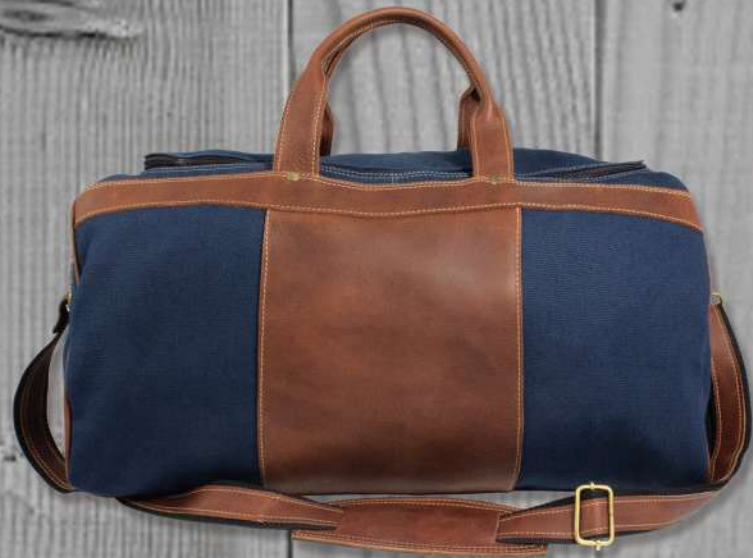
Starboard Duffle #93001 (19" x 11" x 11")