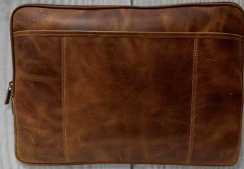
Frontier Sleeve #92526 (15"x 10.5")