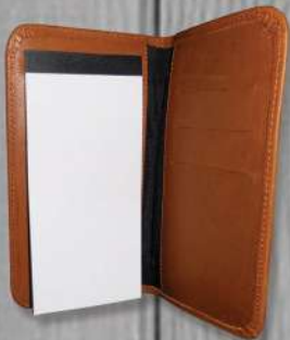
Pocket Manager #90175 (4" x 7")