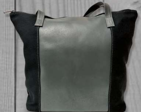
Diva Tote #96401 (11.5" x 5" x 12.5")