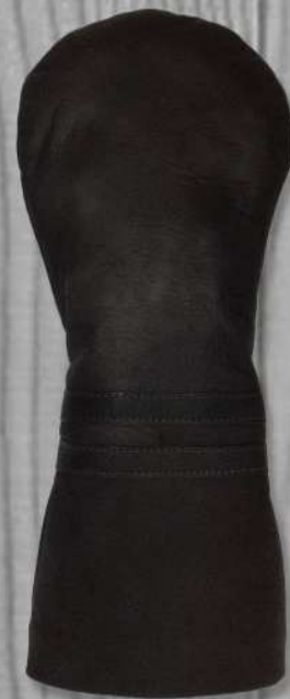
Wood Cover #95186 (5.5" x 3.5" x 13")