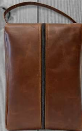
Maverick Shoe Bag #95699 (9.25" x 4.5" x 13.5")