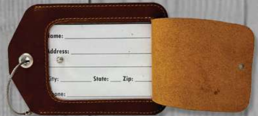
Founders Luggage Tag #95279 (3.5" x 5")