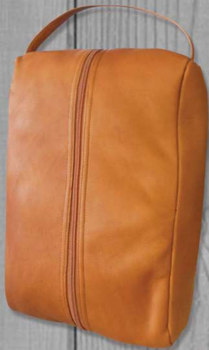
Shoe Bag #90169 (9.25" x 4.5" x 13.5")