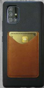
Phone Billfold #95247 (2.5" x 3.5")