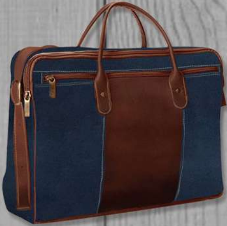
Topside Brief #93789 (15" x 4.5" x 11")