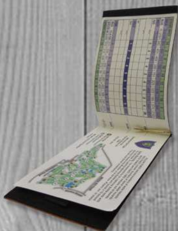
Clip Scorecard (Flip) #94928 (7.5" x 4.5" Closed)