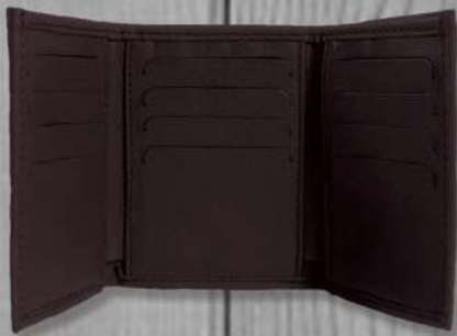
Milo Trifold #92659 (9.5" x 4")