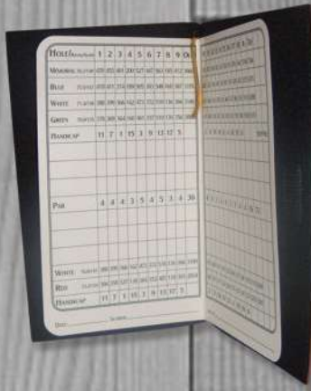
Birdie Clip Card Holder #92514 (6.5" x 4.5")