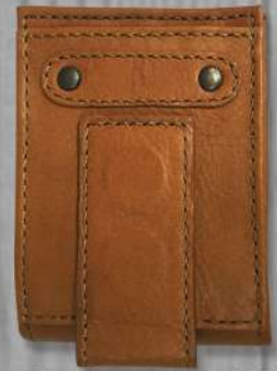
Cayo Magnetic Wallet #93319 (4" x 3")