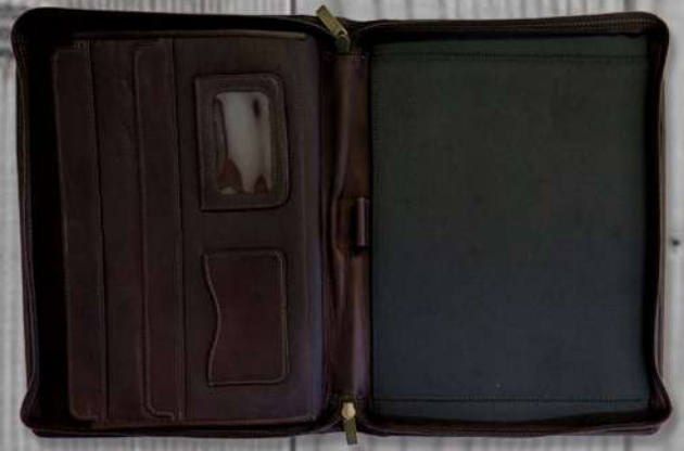
Zipper Portfolio #96089 (13" x 9.5" x 1.25")