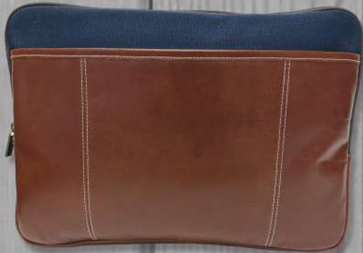
Castaway Sleeve #93526 (15" x 10.5")