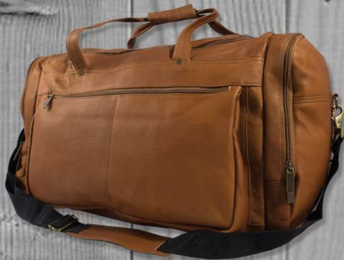
Players Duffle #94958 (21" x 11" x 13.5")