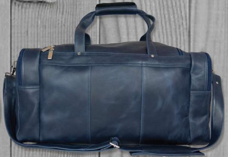
Marquis Duffle #92594 (19.5"x 9.5"x 10")