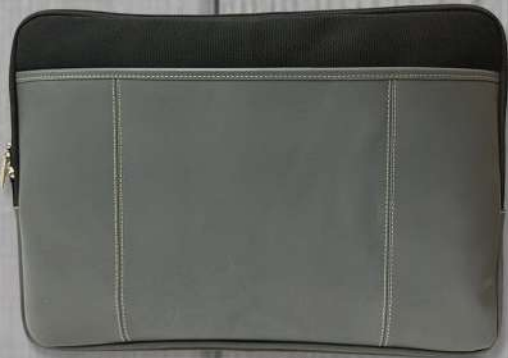
Recon Sleeve #96526 (15" x 10.5")