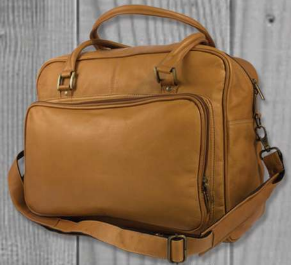
Cruise Zip Tote #95147 (16" x 12" x 10")