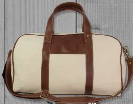
Luau Duffle #94089 (18" x 8" x 12")