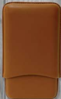
Fore Cigar Case #90149 (7.5" x 4.5" x 2")