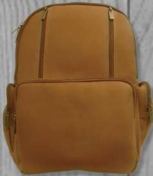
Rover Backpack #93329 (13" x 4" x 16")