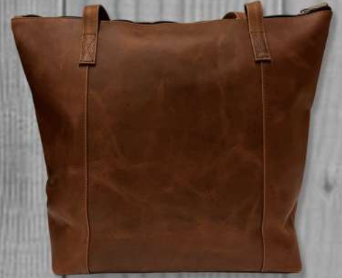
Cheyenne Tote #92154 (11.5" x 5" x 12.5")

Our collection of Hampton Leather adorns the initial 3 pages of our catalog including the cover.