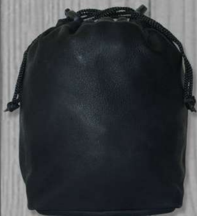
Pro Pouch #94931 (7.5" x 3.5" x 7.5")