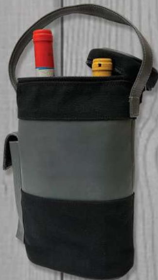
Double Trouble #96186 (12.5" x 7" x 3.75")