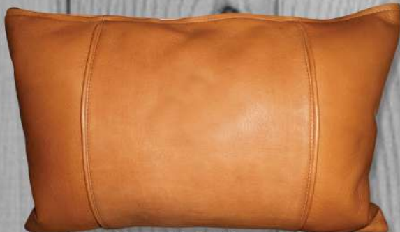
Small Pillow #94902 (18" x 7" x 12")