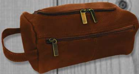
Blaze Travel Kit #95417 (10" x 5" x 6")