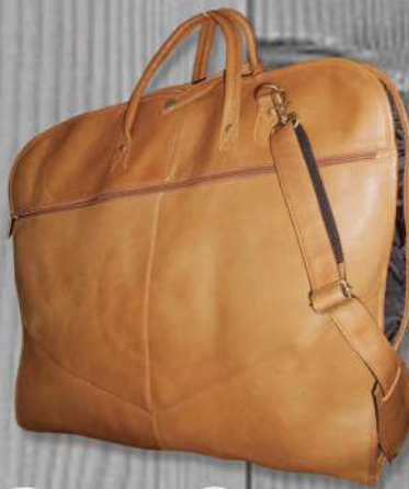
Regent Garment Bag #92169 (23.5" x 42" x 1.5")