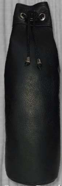
Spirits Pouch #95230 (13.5" x 4" Diam)