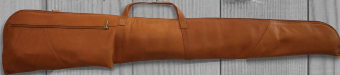
Liberty Shotgun Case #95091 (53" x 10")