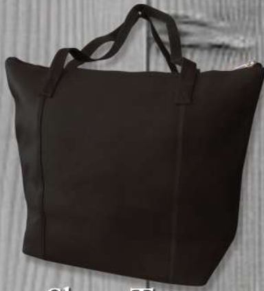
Shop Tote #95409 (11.5" x 5" x 12.5")