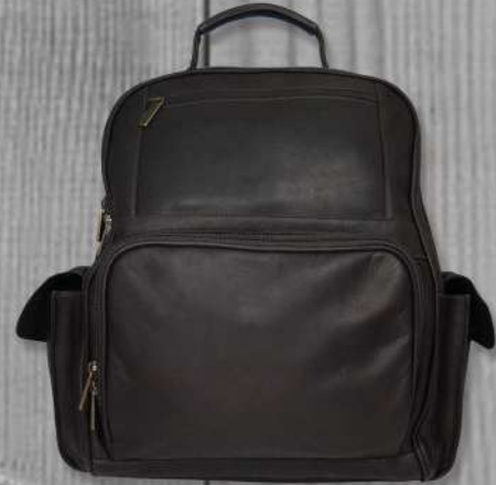
Jet Backpack #93529 (14" x 8" x 17")