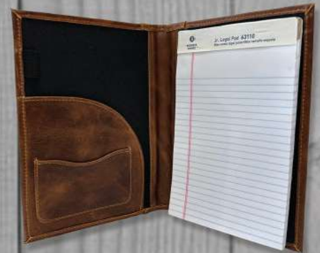
Pecos Portfolio #95603 (6.25"x 8.75")