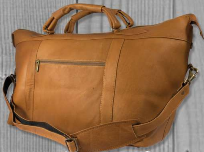
Tradition Duffle #93039 (20" x 14" x 10")