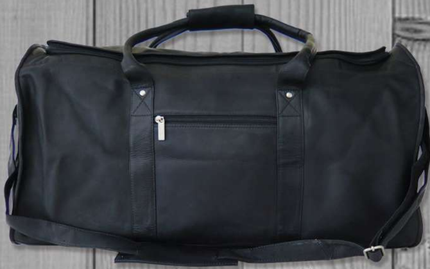
Expedition Duffle #93049 (25" x 10" x 14")