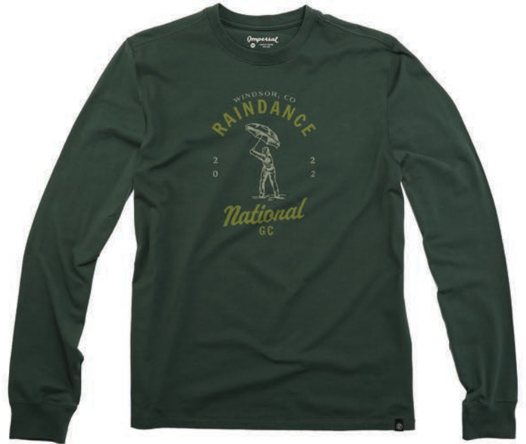
10200L The Après Long Sleeve

Mens' short sleeve crew neck • Athletic fit • Sizes: S – 3XL 97% combed ring-spun cotton 44 singles, 7% spandex 44 singles long staple cotton for buttery softness 5.0 oz. • Set in 1x1 ribbed knit collar Rolled shoulders and double needle sewing at seams Pictured: midnight navy / *Check new color availability