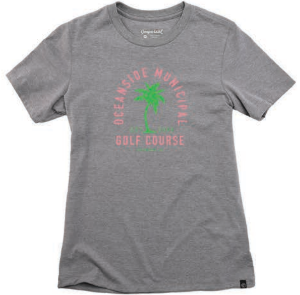
20200 The Après Ladies

Mens' long sleeve crew neck • Athletic fit • Sizes: S - 3XL 97% combed ring-spun cotton 44 singles, 7% spandex 44 singles long staple cotton for buttery softness 5.0 oz. • Set in 1x1 ribbed knit collar Rolled shoulders and double needle sewing at seams Pictured: forest green / *Check new color availability