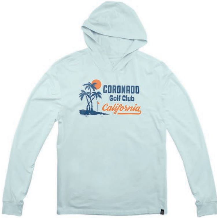
10200H The Après Hoodie

Mens' short sleeve crew neck • Athletic fit • Sizes: S - 3XL 97% combed ring-spun cotton 44 singles, 7% spandex 44 singles long staple cotton for buttery softness 5.0 oz. • Set in 1x1 ribbed knit collar Rolled shoulders and double needle sewing at seams Pictured: Ice Blue