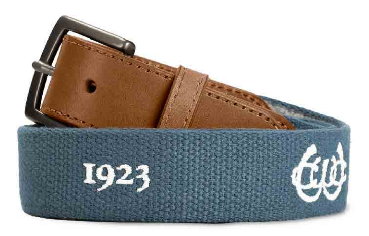
BL101 BROWN LEATHER WITH SATIN GUNMETAL BUCKLE BL101 Available Colors:

The Imperial belt is 1.25" wide, is finished with full-grain rich leather and a solid brass buckle available in two finishes. The Imperial belt can feature either 1 repeating logo or 2 different logos alternating across premium cotton webbing. Up to 7 embroideries can fit based upon logo and belt size.