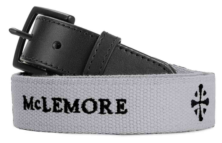
BL102 BLACK LEATHER WITH MATTE BLACK BUCKLE BL102 Available Colors: