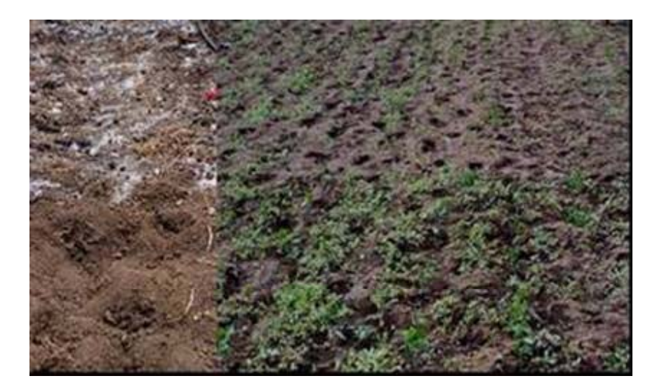
Figure 4. Soil surface application of EM bokashi biofertilizer depressed weeds (Left: before sowing).

First sowing, 1 June 2000; Second sowing, 5 July 2000.