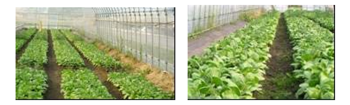
Figure 5. Organic materials placed along the walls of greenhouse (Left) where growing is a brassica leafy vegetable.