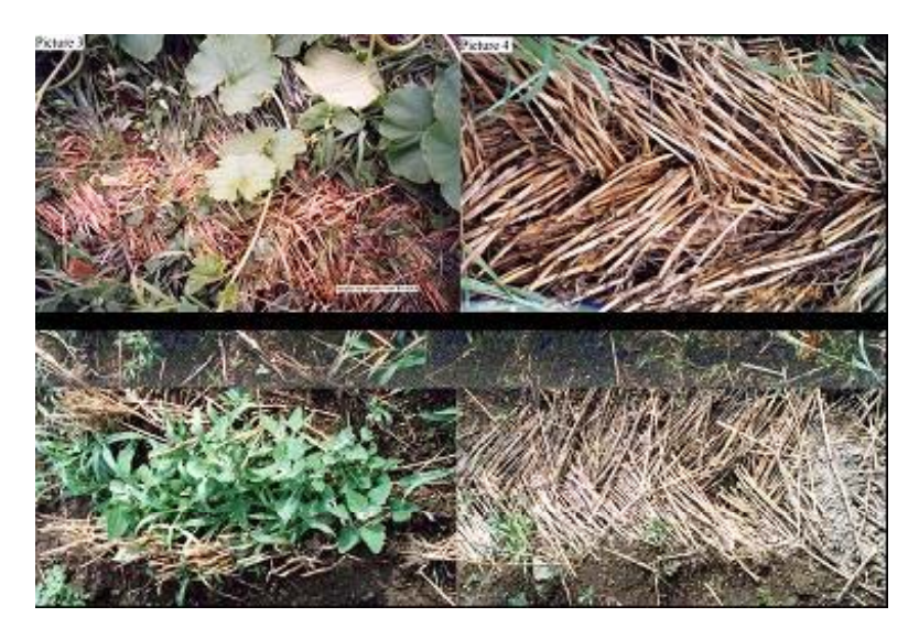
Figure 2. Wheat straws were woven onto the soil surface (Lower left: without woven mulch and weeds thriving; Upper left: pumpkin growing over the mulch).

The author has tried in situ wheat residuals as mulch to suppress weeds in the successive cropping (Xu et al., 2003). The wheat was harvested by cutting the spikes only with the straws left, which were then woven down as pigtail shape on the soil surface. The straws in pigtail shape were closely mulched on the surface and suppressed weeds effectively (Fig.2).