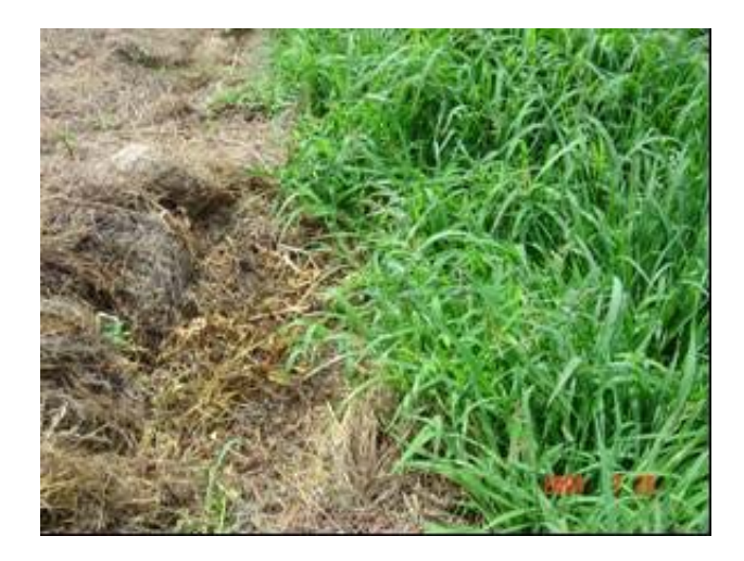
Figure 3. A thin layer of mulch with clipped grasses suppressed the weeds effectively.

Another experiment was done on a small wasteland where weeds were thriving and a thin layer of mulch with clipped grasses suppressed the weeds effectively as shown in Fig. 3. Many research has confirmed the effect of mulching with residual in weed control (Liebl et al., 1992). Although mulching is a useful technique, the thickness required to suppress weed germination varies with the density of the mulch material. Mulch should be thick enough to prevent light penetration and transmission to suppress photosynthesis of weeds. Applying a sufficient thickness for effective weed suppression is often an expensive option. Soil surface can be mulched after the weeds have germinated and the weeds die and ferment under the mulched organic materials as shown in Fig. 3. Mulch layers insulate the soil from high summer temperatures allowing roots to grow to the surface of the soil. Other advantages of the mulch layer include improved soil moisture retention, soil structure and soil fertility.