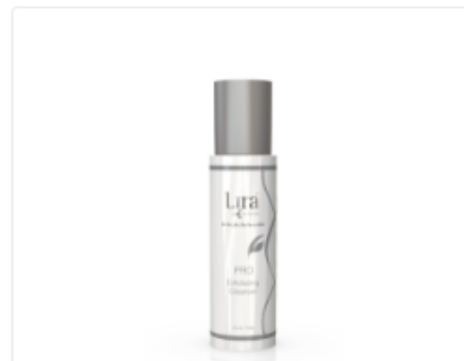
PRO Exfoliating Cleanser

Massage PRO Exfoliating Cleanser into skin for one-minute, removing with tepid water. Not intended for eye makeup removal.