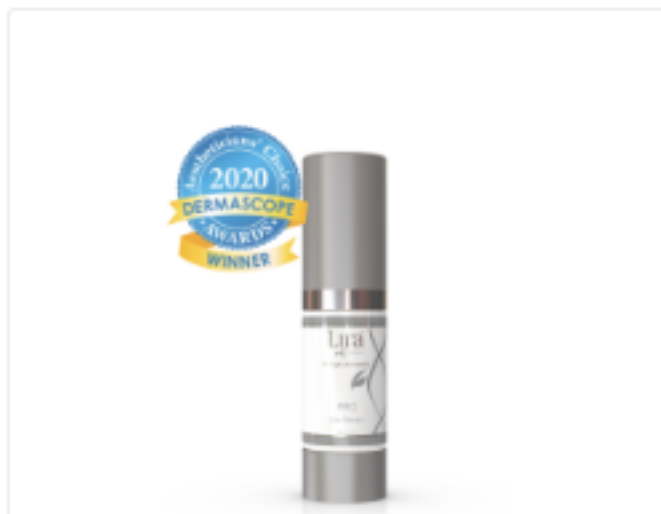
PRO Lite Serum

Apply PRO Lite Serum to face and neck allowing to completely absorb.