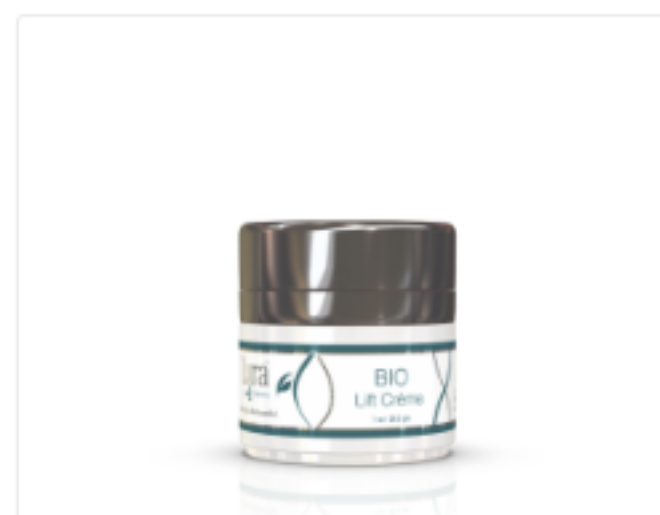
BIO Lift Crème

Massage BIO Lift Crème into face and neck.