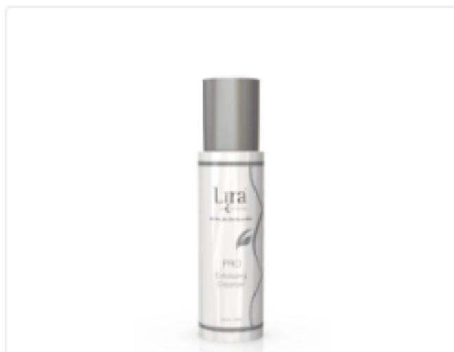
PRO Exfoliating Cleanser

Massage PRO Exfoliating Cleanser into skin for one minute, removing with tepid water.