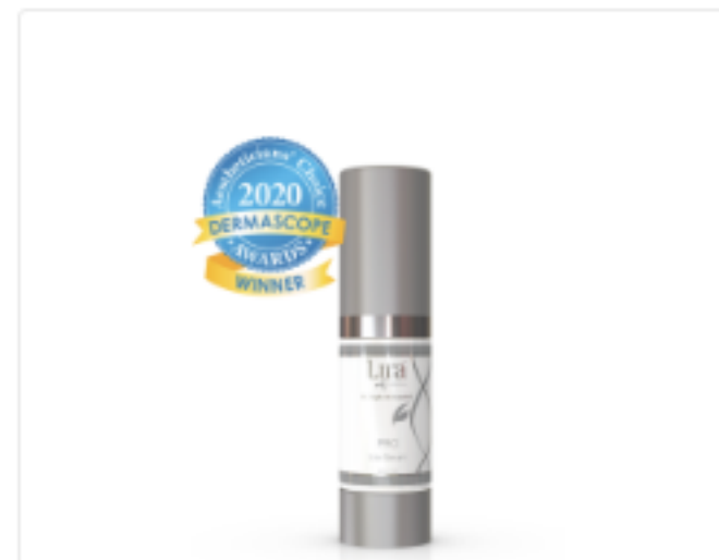
PRO Lite Serum

Apply PRO Lite Serum to face and neck allowing to completely absorb.