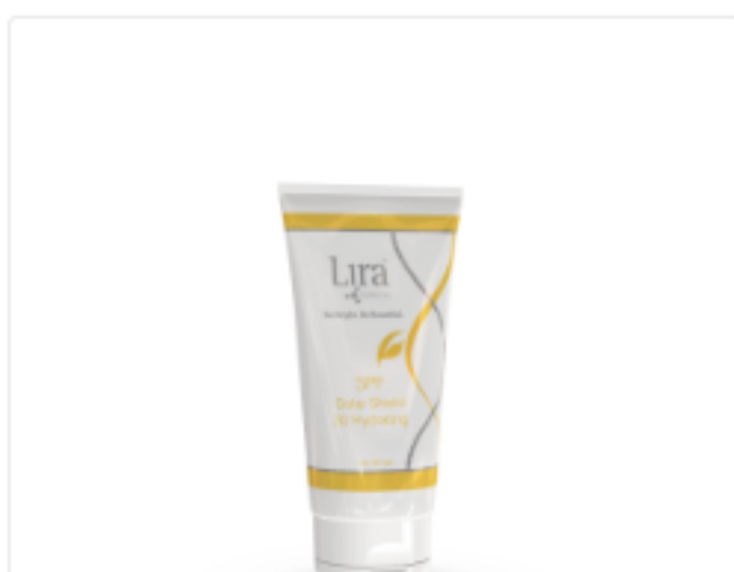
SPF Solar Shield 30 Hydrating

Apply SPF Solar Shield 30 Hydrating liberally for sun protection 15 minutes before sun exposure.