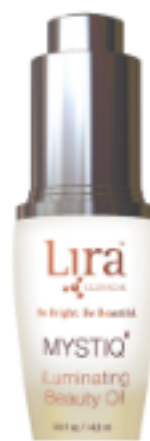
MYSTIQ iLuminating Beauty Oil

Apply 3-4 drops of MYSTIQ iLuminating Beauty Oil to face and neck allowing to completely absorb.