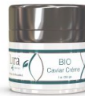
BIO Caviar Crème

Massage BIO Caviar Crème into face and neck.