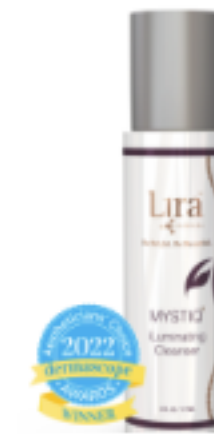
MYSTIQ iLuminating Cleanser

Massage MYSTIQ iLuminating Cleanser into skin for one minute, removing with tepid water. Not intended for eye makeup removal.*