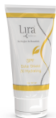
SPF Solar Shield 30 Hydrating

Distribute SPF Solar Shield 30 Hydrating across your fingertips and apply liberally with a pat-n-roll application to face and neck. For sun protection, apply 15 minutes