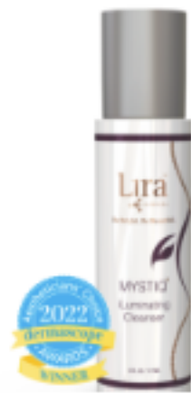
MYSTIQ iLuminating Cleanser

Massage MYSTIQ iLuminating Cleanser into skin for one minute, removing with tepid water.