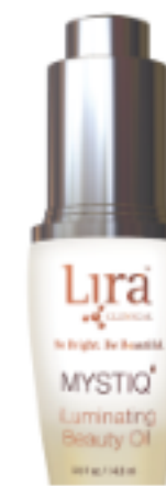
MYSTIQ iLuminating Beauty Oil

Apply 3-4 drops of MYSTIQ iLuminating Beauty Oil to face and neck allowing to completely absorb.