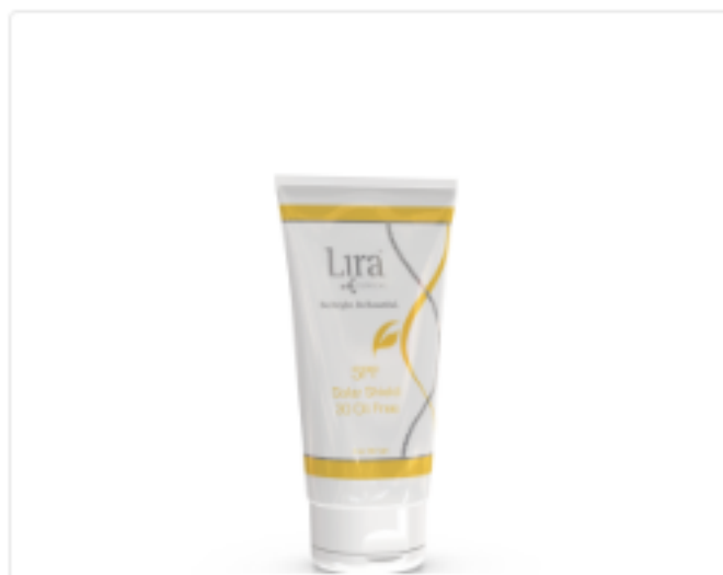
SPF Solar Shield 30 Oil Free

Apply SPF Solar Shield 30 Oil Free liberally for sun protection 15 minutes before sun exposure.