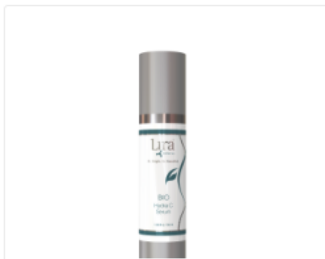
BIO Hydra C Serum

Apply BIO Hydra C Serum to face and neck allowing to completely absorb.