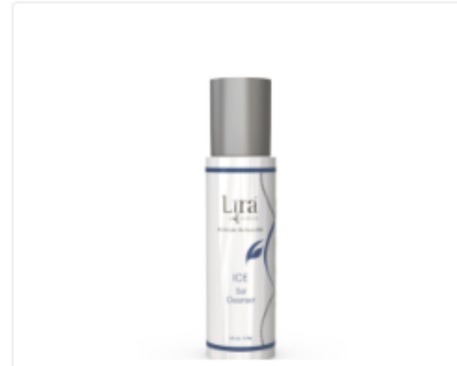
ICE Sal Cleanser

Massage ICE Sal Cleanser into skin for one-minute, removing with tepid water. Not intended for eye makeup removal.*