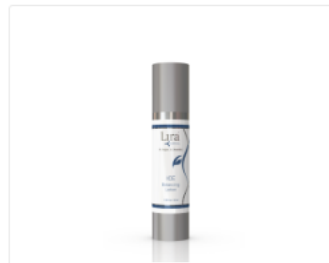
ICE Balancing Lotion

Massage ICE Balancing Lotion into face and neck.