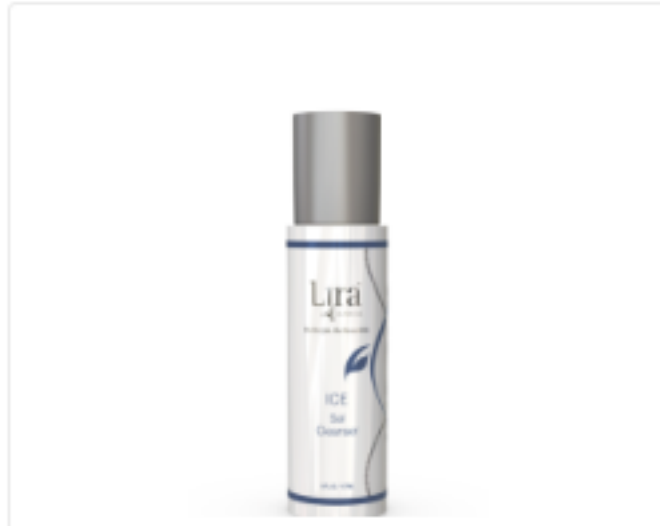
ICE Sal Cleanser

Massage ICE Sal Cleanser into the skin for one minute, removing with tepid water.