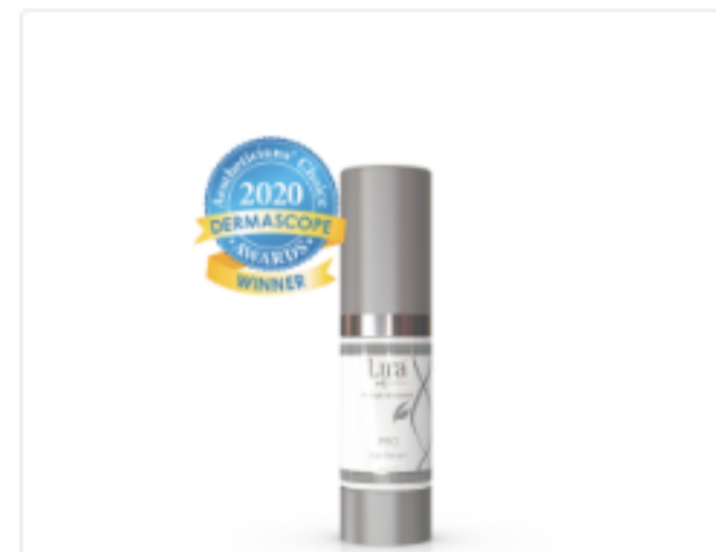
PRO Lite Serum

Apply PRO Lite Serum to face and neck allowing to completely absorb.