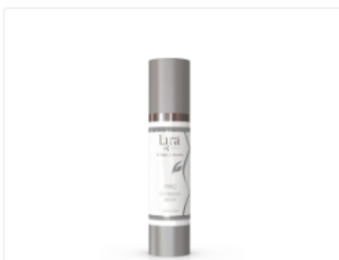
PRO C4 Retinol Serum

Apply PRO C4 Retinol Serum to face and neck allowing to absorb.