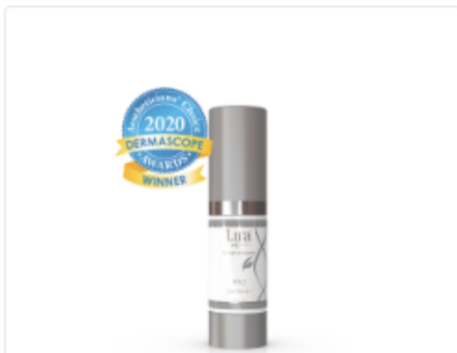
PRO Lite Serum

Apply PRO Lite Serum to face and neck allowing it to completely absorb.