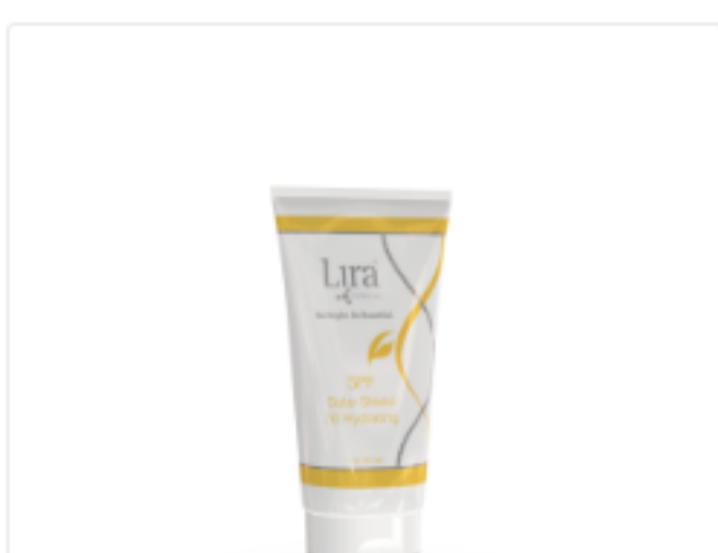
SPF Solar Shield 30 Hydrating

Apply SPF Solar Shield 30 Hydrating liberally for sun protection 15 minutes before sun exposure.