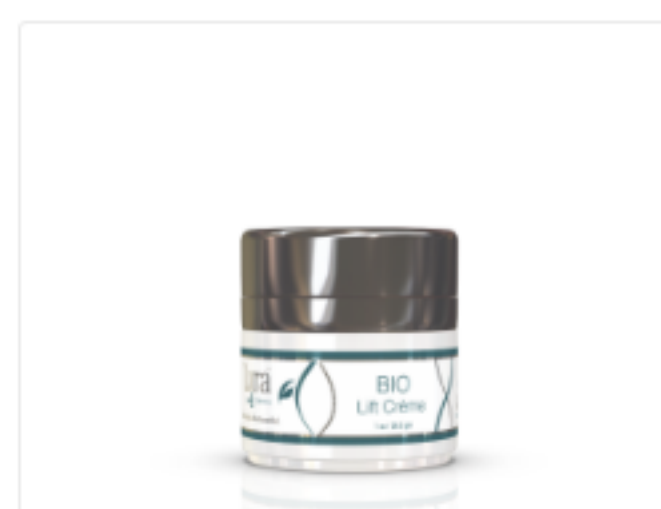
BIO Lift Crème

Massage BIO Lift Crème into face and neck.