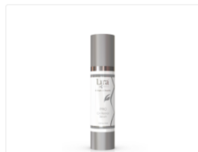
PRO C4 Retinol Serum

Apply PRO C4 Retinol Serum or PRO Retinol Crème to face and neck nightly as directed by your skincare professional.