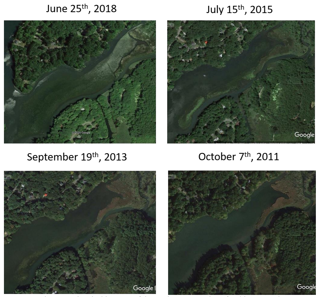
Figure 5. Historical imagery of the northeastern section of Robinson Pond

lakes that have such an extreme watershed load (200:1 watershed to lake ratio) are going to be subject to increased sedimentation and decreased depths over time. The summer drawdown gave the TSPOA a unique look into the future of the northeastern arm if proper management action is not taken.