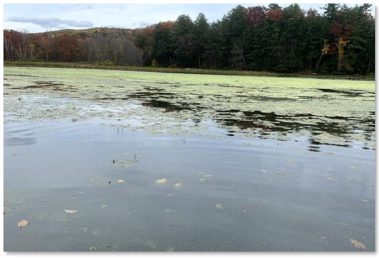
Figure 3. Zone 6 extensive plant and algae growth.

The remainder of the northeastern section has a lot of plant and algae growth, specifically filamentous algae, watermeal ( Wollfia sp.), and sporadic emergent plant growth (Figure 3). The emergent growth extended to the southeast part of Zone 6 and into parts of Zone 5 (Figure 4).