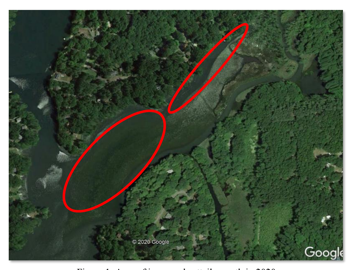
Figure 1. Area of increased cattail growth in 2020

In the summer of 2020, Northeast Aquatic Research (NEAR) was contacted by the Taconic Shores Property Owner's Association to develop a specific action plan for the monitoring and management of new cattail growth that has appeared in the north and northeastern sections of the lake. During the drawdown in the summer of 2020, there was significant expansion of cattails and other emergent plants into the shallow areas in the northern section of the lake adjacent to the Roeliff-Jansen Kill (Figure 1). Access in and out of this area was significantly reduced for boating due to the increased growth.