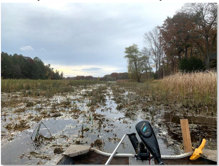
Figure 2. Northeastern Section of Zone 6, with extensive emergent growth

NEAR inspected the entire pond with a special focus on the emergent growth in the northeastern section. In this section, we used a combination of field notes, GPS waypoints and photos to develop an acreage estimate for the emergent area. We estimated that there were ~14 acres of new emergent plant growth in this section (Figure 4). This may be an underestimate, as there was extensive management of this area via mechanical harvesting, which can make it more difficult to spot underwater stems. The densest and most recreation-impacting section of growth was along the shore of the northeastern section of Zone 6 (Figure 2; Zone map in appendix A). This area was completely overgrown with emergent plants and was difficult to navigate with a rowboat. We did find two small water chestnut plants in this area, which were pulled.