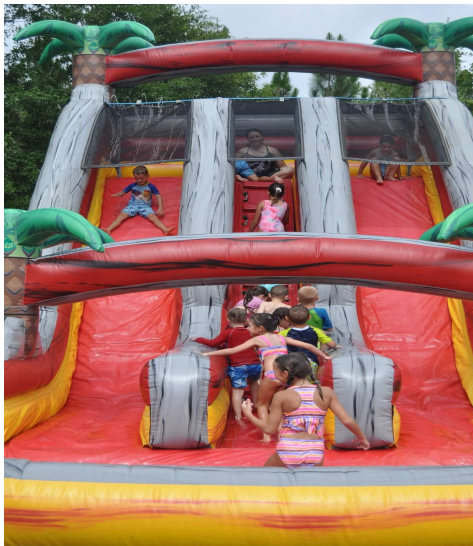
WLJTA Members having fun!