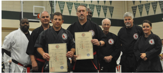
UCMAA Board members