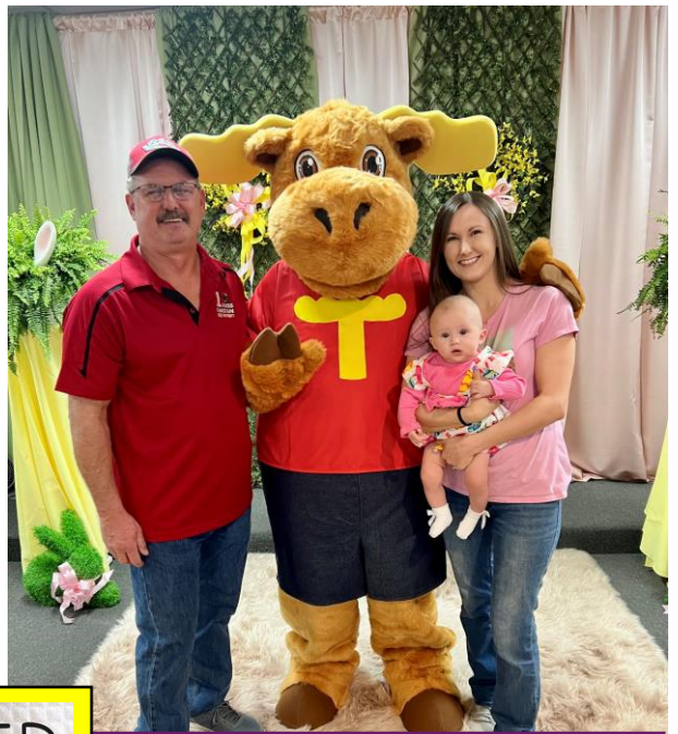
3 Generations Moose Family