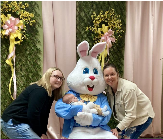
Our Bunny & Moose family