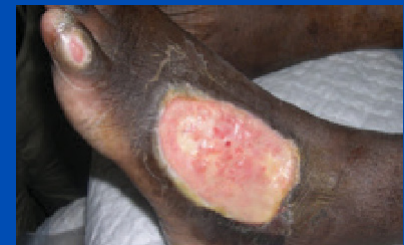
DAY 0: No Treatment

Device can be used for highly complex cases down to bio-film removal providing better outcomes. The photos show the biofilm removal and healing over time. The skin pigmentation did not return, but the wound healed over.