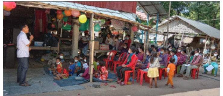
This church community in Prey Veng is very excitedly anticipating the new school which will be built this year, funded by partners from Omaha, Nebraska. The village leaders are endorsing this project, encouraging their villagers to send children to Garuna Christian School.

Today, 7 Garuna Christian Schools are operating in Cambodia with 1,246 students enrolled. School #8 is under construction and school #9 will be built soon. Sites for new schools are selected based on the need and openness of a community as well as the availability of strong school leaders – ideally students who are part of Garuna's LISA Bible training program. A coalition of Omaha (Nebraska) churches