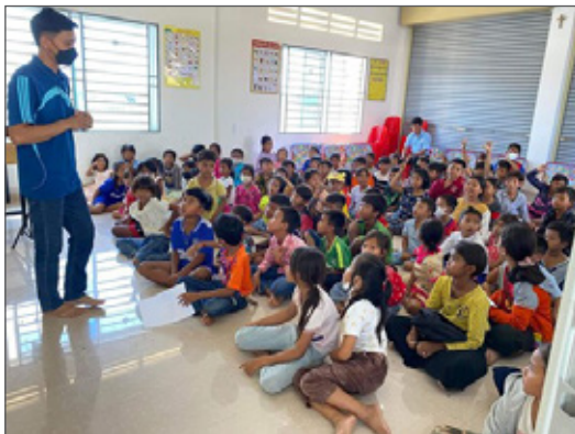
It wasn't long after Garuna's 7th school opened in Phnom Penh, that nearly 100 students were meeting for Sunday School each week!

The Garuna Christian Schools are used for year-round school for students in Grades K-6, but are also designed to be multi-purpose, serving as a church plant, for Sunday School, youth activities, and for other community gatherings. At this point, all 7 of the schools now offer a Sunday School program and are seeing significant numbers of young people attending. We are so thankful for this open door for sharing the Gospel.