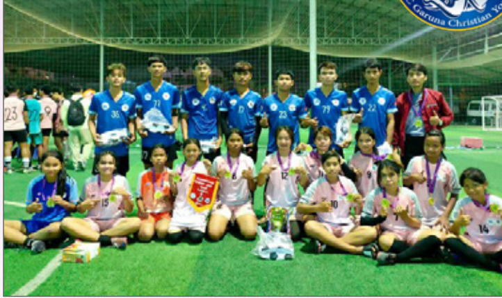
The boys' and girls' teams celebrate their victories after the soccer tournament. They love this outreach activity which combines ministry and sport.