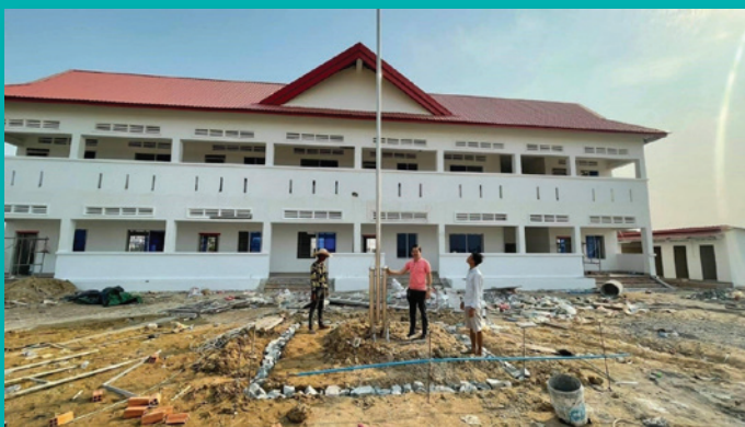
Garuna's new school (#7), training site, and home office is located on the outskirts of Phnom Penh, Cambodia. The rocks that outline the base of the flagpole will soon be surrounded by children lined up for the flag salute and morning prayers.