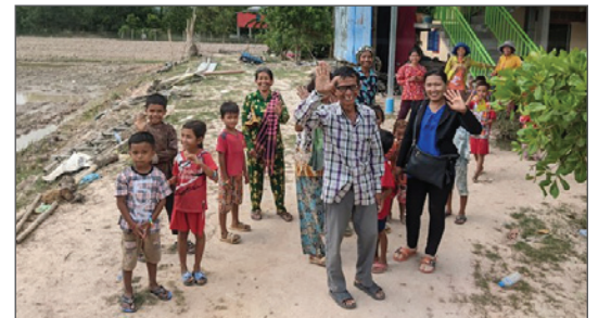
The rice field on the left, just a stone's throw from Vietnam, will soon be a school and growing Cambodia Lutheran Church site, led by a pastor and deaconess from Garuna's LISA Bible training program.

A highlight of the trip was to see the new location for Garuna Christian School #9 in Prey Veng. There was time to meet the neighbors, children, the pastor, and the deaconess. They can't wait for the new school to be built and open for their village, expecting it will also expand their growing church ministry. The hard title and building permissions were recently secured, so it won't be long now. Garuna Christian School #9 is being funded by a coalition of 9 very generous Omaha area churches and the students at Concordia Lutheran Schools of Omaha.