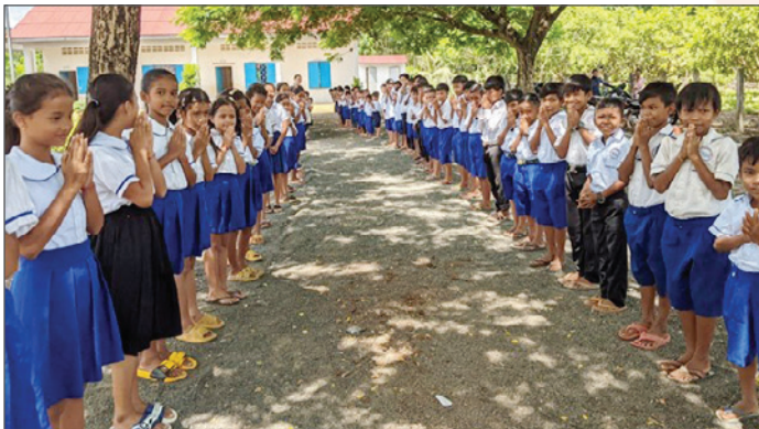
The Garuna Kids are respectful, loving and kind. Please pray for their studies, their families, and their growing faith!

A common scene upon our arrival at each school was this "welcome home" greeting from the Garuna Kids attending each school. Heartwarming, for sure! It was a joy to see the students and the growth since our last visit in January 2020. At that time, the enrollment was 1,027. It has grown now to 1,321. It is clear that God has blessed the work of Garuna's national leaders in Southeast Asia. They are absolutely dedicated to God's mission.