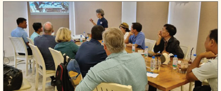
It's wonderful to join with these strong Asian leaders to plan strategies to reach their own country and their neighboring regions for the Gospel.

The Garuna-Thailand team joined the Garuna-Cambodia team to share, encourage, collaborate, and brainstorm for future ministry ideas and projects. Both countries have a LISA program, which operates in ways conducive to their country situations. Ideas were shared about future school projects and LISA program delivery ideas throughout the southeast Asia region. It was wonderful to see the obvious feelings of appreciation and respect for their Asian co-workers.