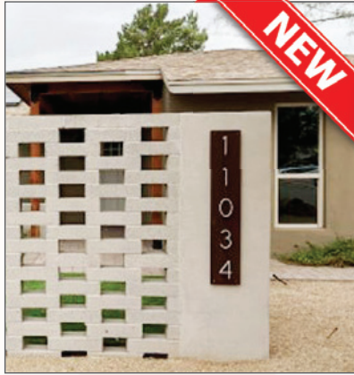
11034 North 36th Street, Phoenix, AZ 85028

Our new address: Garuna, 11034 North 36th Street, Phoenix, AZ 85028. We hope to hear from you!