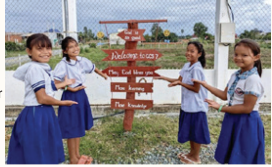
Be Our Guest! The friendly students at GCS #7 in Phnom Penh love to welcome visitors to their campus!

(EIN number: 86-1037570). Garuna will mail a gift receipt to the address you provide. Thank you in advance for your partnership in prayer and financial support.