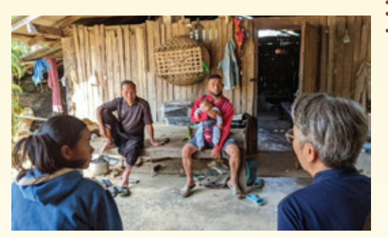
Sharing Jesus with hilltribe groups along the Thai border.

to move its Thailand gospel outreach from Bangkok to Chiang Mai. Plans are being made to purchase a site and to move/add staff to work in a collaborative manner from this northern Thailand hub. Besides work in the Chiang Mai area, Garuna will continue to reach into nearby closed countries and the hilltribe groups near the border. Currently, Garuna has work in this region, but with increasing invitations and opportunities, a more centralized team and approach will be a new focus. It's an exciting new opportunity. Watch for updates in the next issue!