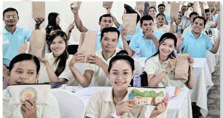
These inviting smiles welcome the Garuna Kids and their families to their schools.

Garuna's 50 school teachers are a blessing to their students and families. They have continued to meet with their students as allowed or to visit students for small group instruction while maintaining and improving the 7 Garuna Christian Schools which are ready to reopen after recent summer Covid-19 closures.