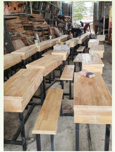
The desks purchased by the Wisconsin students were crafted by Cambodian carpenters in Phnom Penh. "Buying local" is Garuna's goal whenever possible!