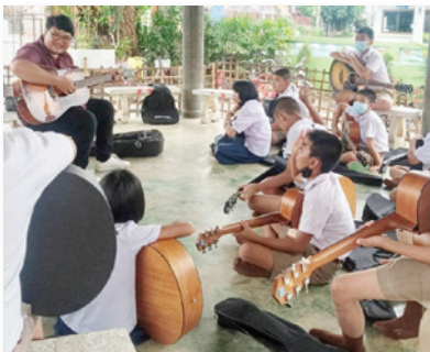
Thai students from the public schools are thrilled to have an opportunity to learn how to play guitars as they also learn about Jesus from their teachers and the songs.