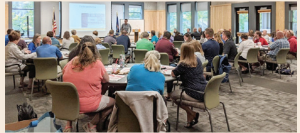
Michigan District principals prepare for their new school year, including Garuna as a part of their planning! They want to help their students make an impact in Cambodia.