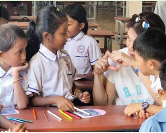
Concordia Shanghai teachers, students and families love to visit the Garuna Christian Schools to help share the love of Jesus with the Garuna Kids in Cambodia.