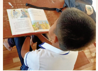
Few children in Asia have heard and understood the life-changing Christmas story.