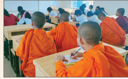
Garuna Christian Schools are half-day tutorial schools, operating during mornings and afternoons. K-6th grade students are taught math, Khmer reading and writing, English and Bible to all who register with their parent/guardian's approval.

Christian and teach the Bible, in addition to the other subjects. The monk from the nearby temple was happy to have the six young Buddhist novices attend GCS #7 in Phnom Penh where they now hear the Good News of Jesus each day.