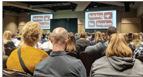
These LCMS teachers from North and South Wisconsin join together to worship, learn, and fellowship as they help build up God's kingdom in both the USA and Cambodia.

We couldn't do it without you! To the many districts, schools, and churches in the USA who love to help the Garuna Ministries, we say thanks. The North Wisconsin District schools recently purchased all the desks and furnishings for our newest school in Phnom Penh, which just opened. The South Wisconsin and Michigan Districts are joining together to build a 2-classroom building, restrooms, handwashing facilities, and purchase desks during this school year. They will expand the capacity of our very first Garuna Christian School in Tbong Khmum, built in 2013. This project will provide them needed facilities for a growing enrollment and the addition of a new Kindergarten program!