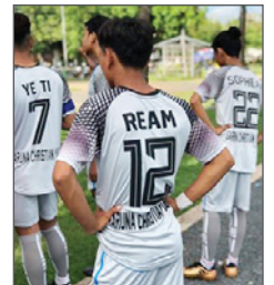
The Garuna Christian Youth soccer teams provide a great opportunity for fun, fellowship, and Bible study for Asian youth.

The challenge for churches to impact teens is felt throughout the world. Soccer (or football as it is known in Asia) is a tremendous interest for young people and one that Garuna's staff has encouraged to create community and share Jesus.