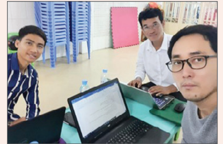
Garuna's team loves to learn through workshops or enrollment in degree programs, all the while continuing in their local ministry.

Garuna is blessed to be able to provide advanced training (bachelors and master's degrees) for some of the Southeast Asian Lutheran leaders. The best part of these programs is that the students can study without having to leave their homes, ministries, or families – and there is immediate application of their knowledge to their current ministry.