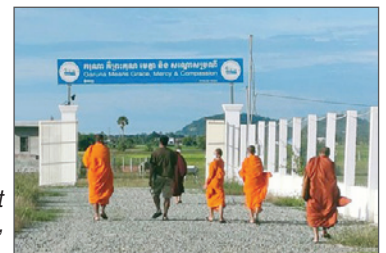
As students leave the Garuna Christian Schools, we pray that God's Spirit and the Christmas promise touches their hearts, overflowing into the lives of their families and friends.