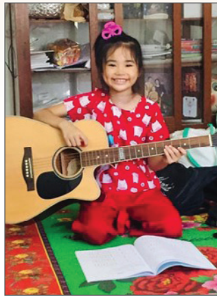
It is easy and fun to share the Gospel message through music.

The team in Thailand has found the teaching of music and English to be helpful tools for the church. These