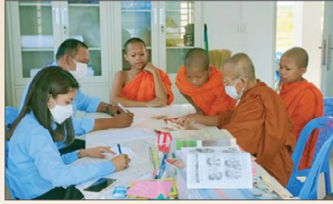
Buddhist orphans are registered by the temple leader for enrollment at the new Garuna Christian School. Cambodia is 98% Buddhist, so most of Garuna's students come from a similar background.

The 7th Garuna Christian School was recently completed and began to register new students as Cambodia schools reopened November 1. Following sporadic COVID quarantines, this event was met with excitement as many families registered their children each day. Most surprising was to see an adult Buddhist monk who asked if Garuna could help educate some orphans from the nearby temple. Garuna's leaders explained that the schools are