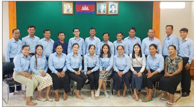
The 22 Garuna leaders guide their local teams in sharing Jesus with 1200 children (and families) in their care. This meeting even included new staff who are becoming acquainted with the team and the plans.

Garuna's goal to train indigenous leaders was put to the test during the past 2 years during quarantines and travel restrictions. And the local teams passed the test! They used home visits, Zoom calls, and Facebook Messenger tools to maintain and grow the various school, church, and outreach ministries in the country as they followed the country's mandates and guidelines. Garuna's principals, vice principals, and Bible teachers from 8 schools recently gathered together for the first time in a year. They met in Phnom Penh for devotions, singing, planning, fellowship, and encouragement. They are amazingly dedicated and talented leaders. Their gifts spill over to thousands in their regions!