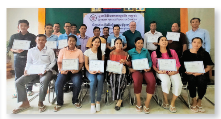
LISA students studying the Book of Concord that was recently published into the Khmer language by LHF.

• IRA Charitable Rollovers or IRA RMD's can provide an opportunity for stewards over 70½ to make gifts to Garuna from their IRAs directly no income taxes due on rolled over or donated funds.