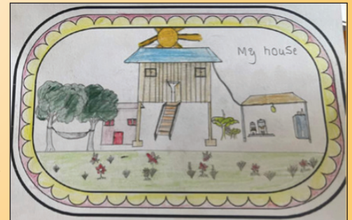
A drawing of a Cambodian (earthly) home by a GCS student who now has learned about his heavenly home!