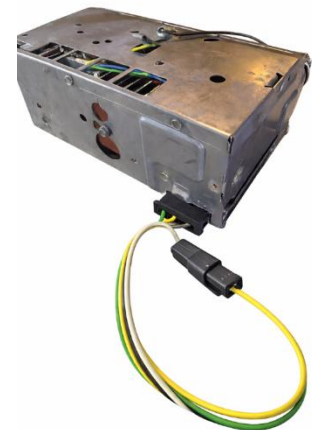
Figure 1 – Mounting Bracket