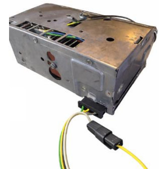
Figure 2 – Wiring Harness