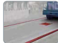
SURVIVOR ® PT Pit-type concrete or steel deck scales