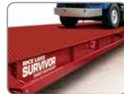
SURVIVOR ® ATV Heavy- and super-duty top access portables