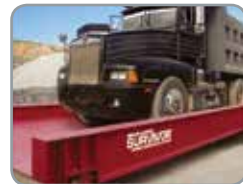
SURVIVOR ® SR Extreme-duty, low profile concrete or steel deck siderail scales