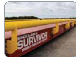
SURVIVOR ® OTR Top access, low profile concrete or steel deck scales