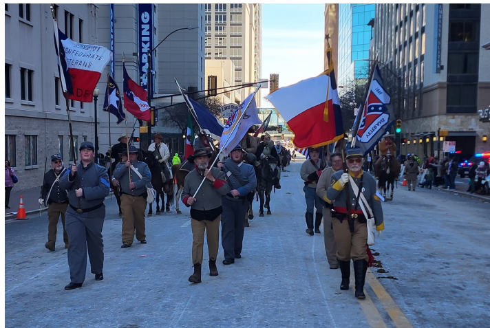
While other camp member handed flags out to the crowd.